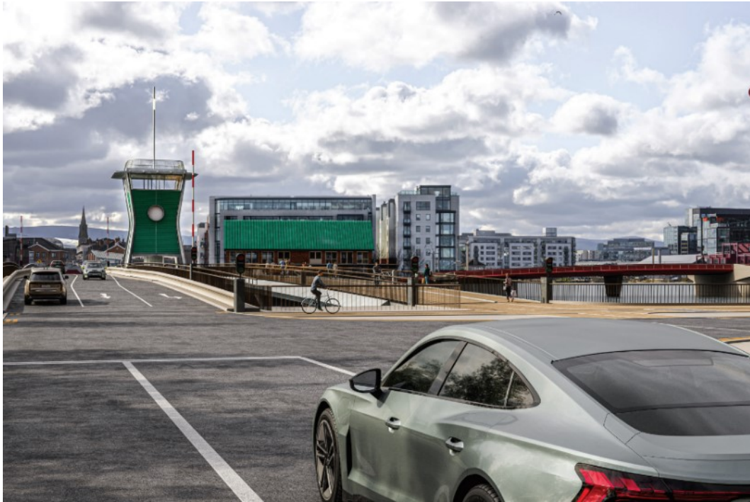
Photomontage 1 - View of Tom Clarke Bridge Widening and Point Pedestrian and Cycling Bridge with proposed control tower from North Wall Quay