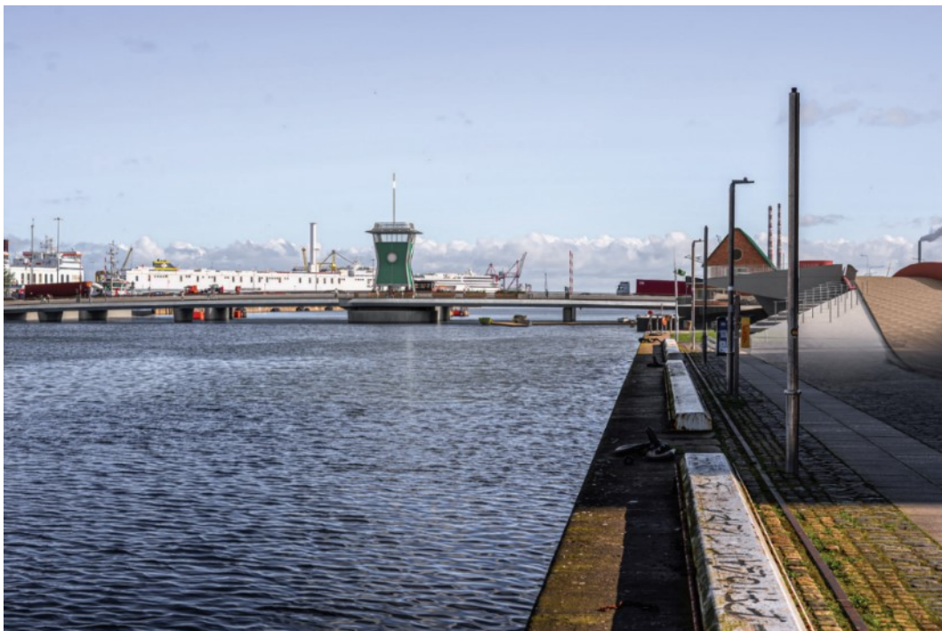
Photomontage 2 - View of Point Bridge and control tower from Sir John Rogerson's Quay