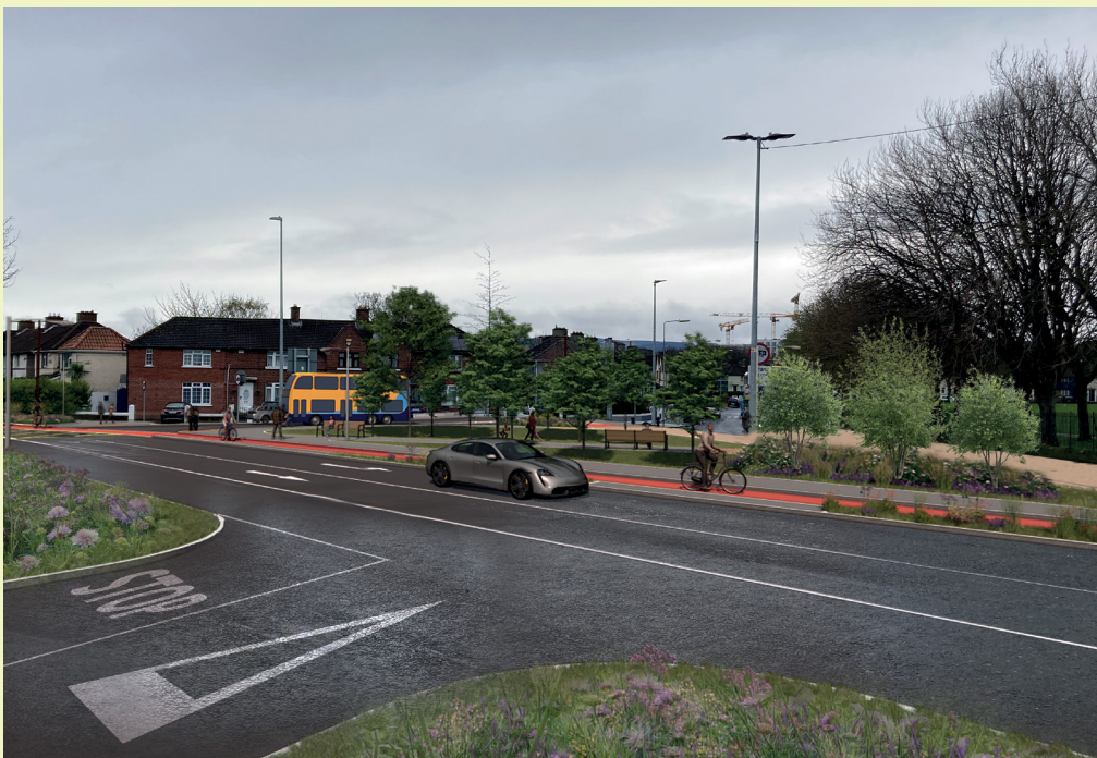
Artists impression of the proposed scheme looking across Dolphin road from Grand Canal View