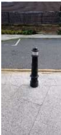
Image 4: Example Pencil Bollard on Footpath, Cromcastle, Kilmore, D5

Lighthouse bollards along the edge of the western footpath, outside the northern part of the school zone on Marino Park Avenue . (These are depicted as black and white dots on the design drawing).