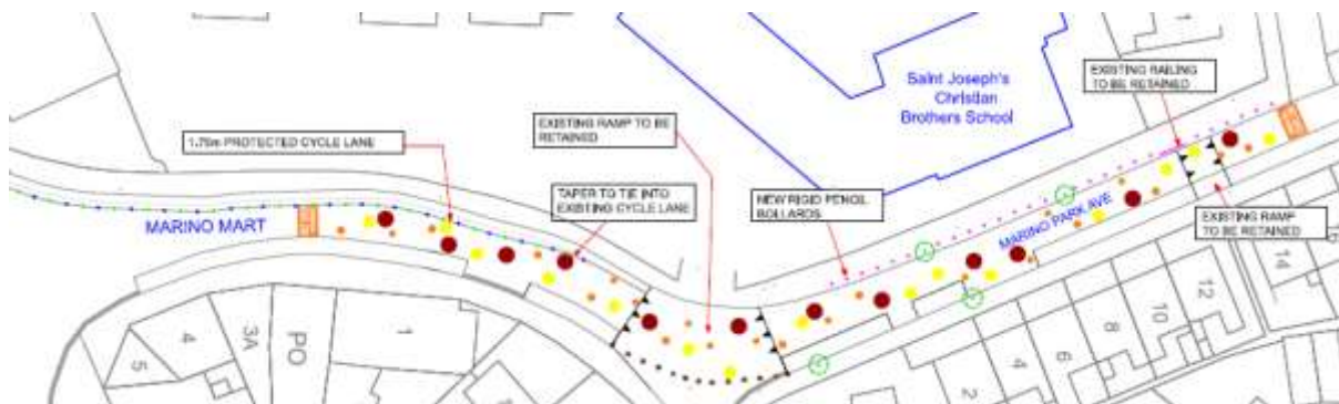
Image 3: Extent of the works at St. Joseph's CBS Primary School Marino Mart and Marino Park Avenue