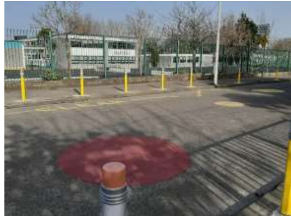
Image 6: Example Circle Road Surface Markings, Thornville Rd, Kilbarrack, D5

Colourful road markings consisting of yellow and red circles painted directly on the road outside the school on Merville Avenue and also outside the school on Marino Park Avenue .