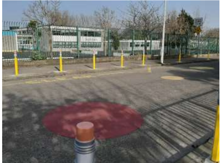
Image 4: Example Circle Road Surface Markings, Thornville Rd, Kilbarrack, D5

Colourful road markings consisting of yellow and red circles painted directly on the road on Montrose Park on approach to the school at the Church of Nativity entrance.