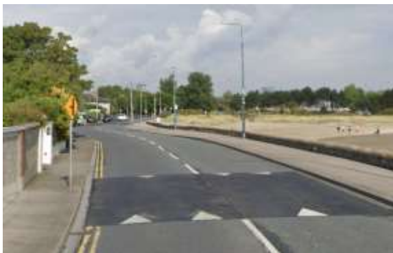
Image 5: Example Road Surface Sign for School Zone, Leinster Road, Rathmines, D6

The existing speed ramp on Montrose Park will be retained.