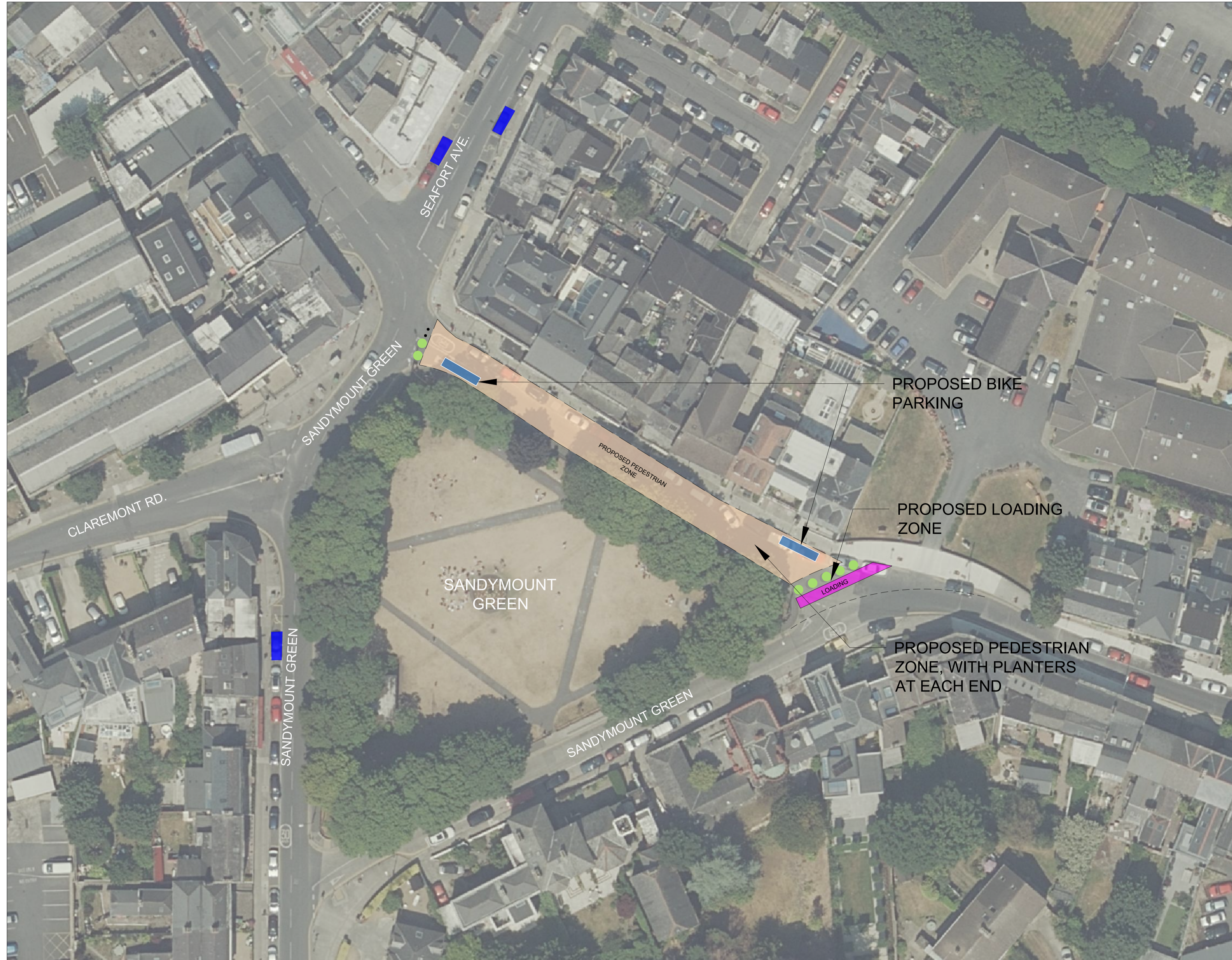
SANDYMOUNT VILLAGE PROPOSAL