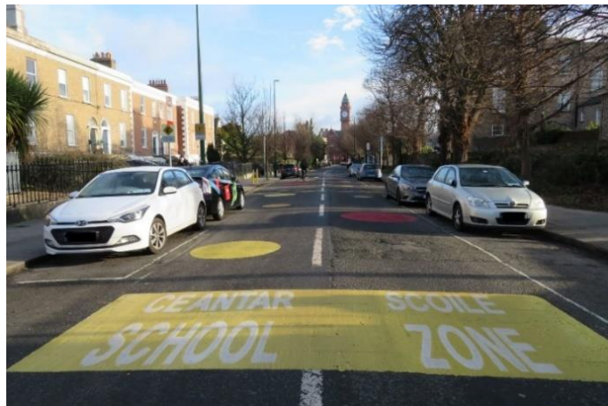
Image 4: Example road surface sign for School Zone, Leinster Road, Rathmines, Dublin 6

2 School Zone road surface signs will be painted directly on the road on James's Place East. The entrances to the school zone is marked with these painted yellow boxes at the beginning and end of James Place East and reads SCHOOL ZONE: CEANTAR SCOILE. This alerts road users that they are coming up to a school.