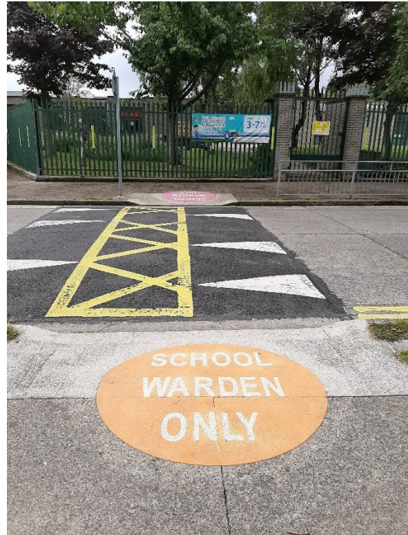
Images 5 and 6: Example school warden crossing and buff paving at Scoil Neasáin, McAuley Rd, Dublin 5

New School Warden Crossings will be introduced. The footway at the crossing points will be dished with buff coloured tactile blister pavement inserts added. This tactile paving prevents trips and slips. The paving is more user friendly for people with mobility and visual impairment needs.