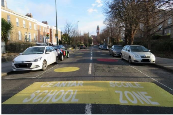
Image 4: Example road surface sign for School Zone, Leinster Road, Rathmines, Dublin 6

'School Zone' road surface signs will be painted directly on St. Brigid's Rd and School Avenue on approach to the school gate. This is to advise motorists they are in a School Zone and to drive accordingly.