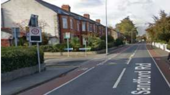
Image 7: Example School Ahead Flashing Amber Sign, Sandford Road, D6

A new School Ahead Variable Message Sign to be provided on Collins Avenue East before the junction with Clancarthy Road.