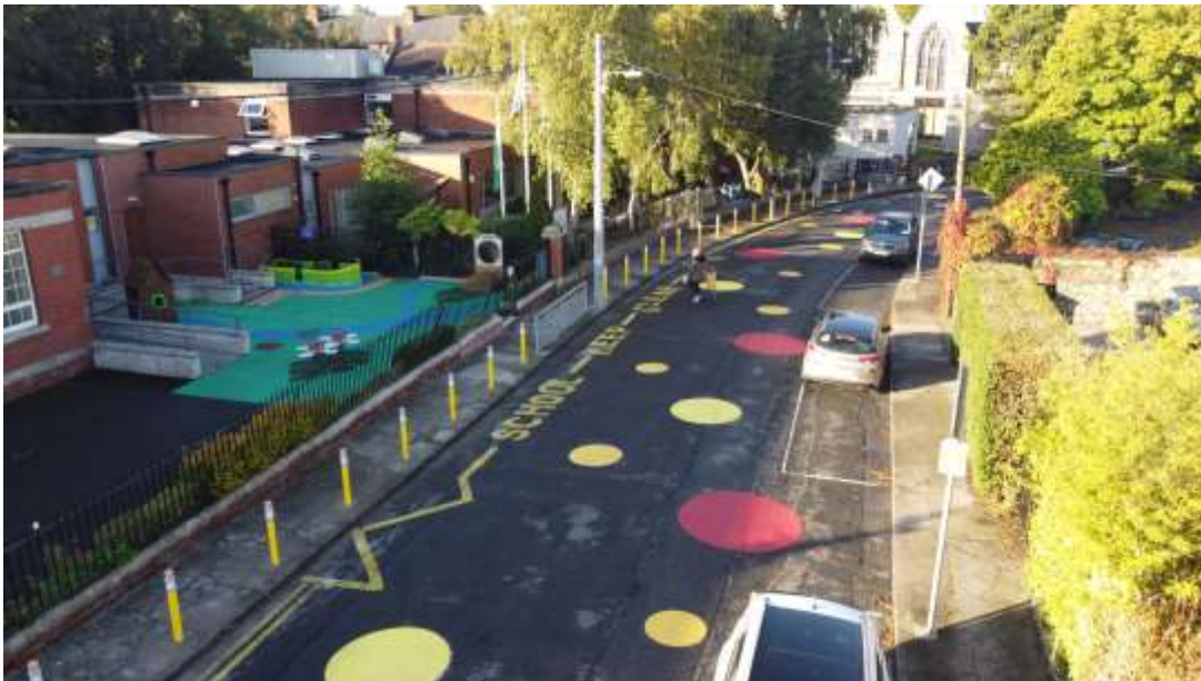
Image 1: Example of School Zone at Star of the Sea School, Sandymount, D4

School Zones are built infrastructural upgrades that are designed to give priority to students at the school gate by freeing up footpaths and reducing vehicle drop-offs, pick-ups and idling. The aim is to increase safety at the front of school and prioritise active travel (walking, cycling, wheeling and scooting) to and from school.