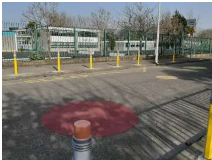
Image 5: Example Circle Road Surface Markings, Thornville Rd, Kilbarrack, D5

Colourful road markings consisting of yellow and red circles painted directly on the road on Clancarthy Road at the entrance to Our Lady of Consolation National School and on Collins Avenue East at the entrance to Scoil Chiaráin CBS.