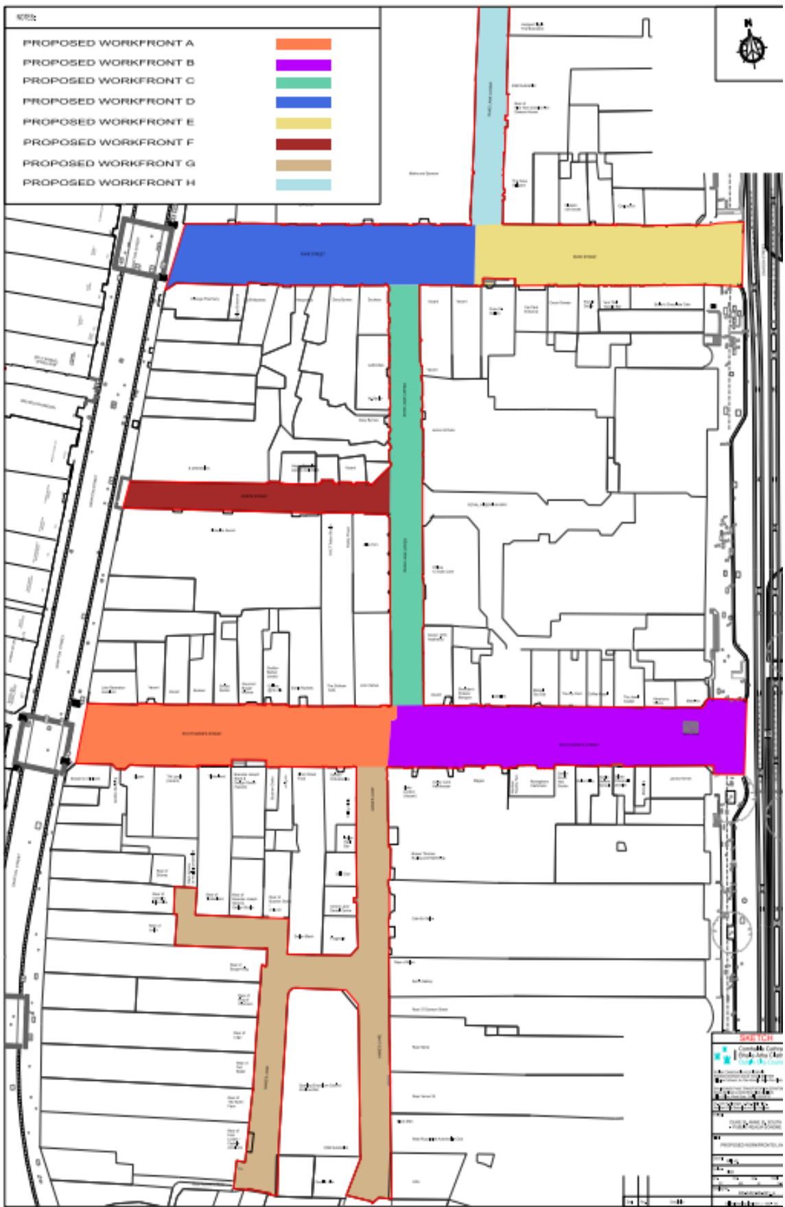
Figure 1 Proposed Work front Layout