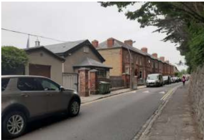
Image 10: The Existing Double Yellow Lines Outside Drumcondra National School

The existing double yellow lines remain outside the school on both sides of Church Avenue. These are depicted as double black lines next to the kerb on the design drawing.