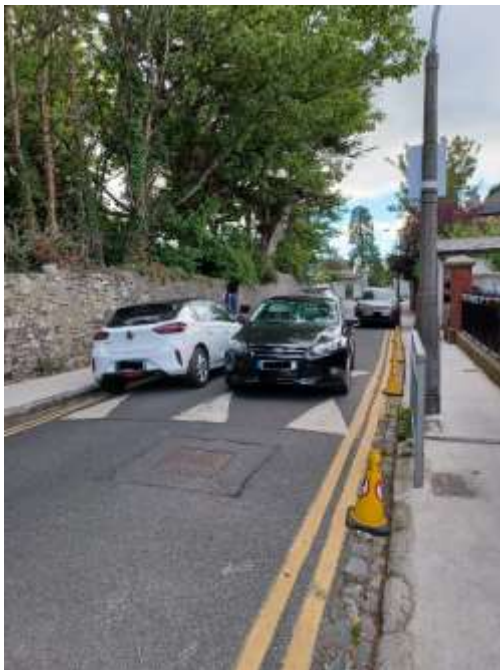
Image 11: Example of cars trying to pass at the front of Drumcondra National School