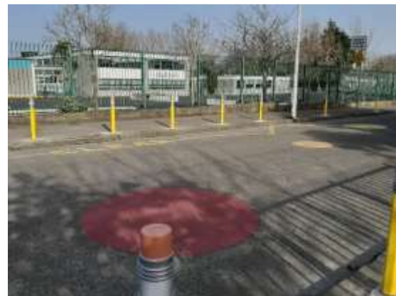
Image 4: Example Circle Road Surface Markings, Thornville Rd, Kilbarrack, D5

Colourful road markings consisting of yellow and red circles painted directly on the road on Church Avenue outside the school entrance.