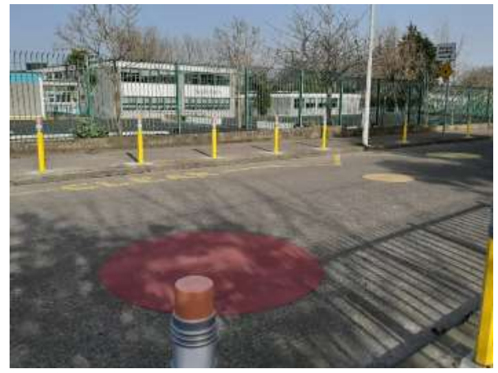
Image 4: Example Circle Road Surface Markings, Thornville Rd, Kilbarrack, D5

Colourful road markings consisting of yellow and red circles painted directly on the road on Montrose Park on approach to the school at the Church of Nativity entrance.