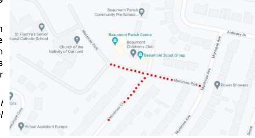
Image 2: Extent of the works at Saint Fiachra's Junior National and Senior National Schools

These works will take place on Montrose Park and Montrose Close, Beaumont, Dublin 5, on approach to Saint Fiachra's Junior National and Senior National Schools.