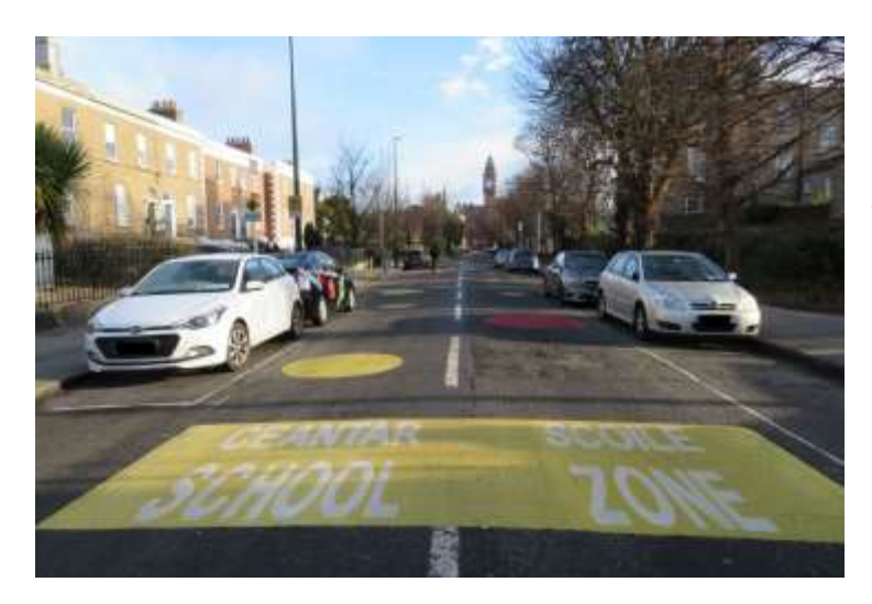
School Zone road surface signs will be painted at 1) the entry point to Montrose Park from Montrose Avenue and 2) on approach to Montrose Park from Montrose Close.

Image 5: Example Road Surface Sign for School Zone, Leinster Road, Rathmines, D6