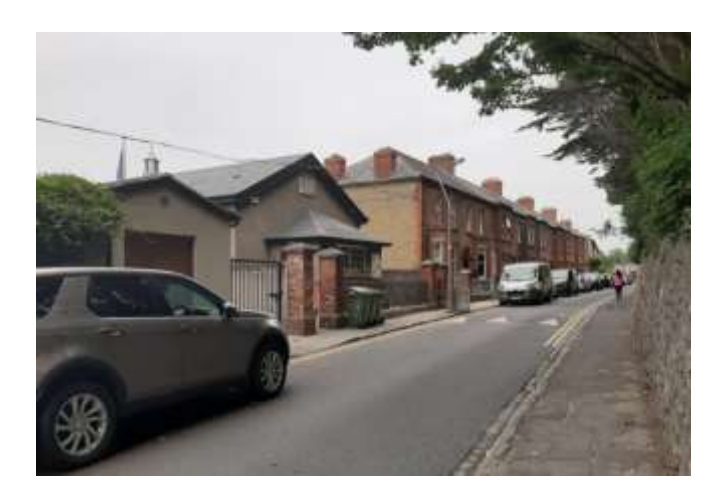
Image 10: The Existing Double Yellow Lines Outside Drumcondra National School

The existing double yellow lines remain outside the school on both sides of Church Avenue. These are depicted as double black lines next to the kerb on the design drawing.