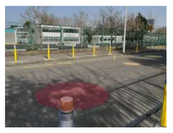
Image 4: Example Circle Road Surface Markings, Thornville Rd, Kilbarrack, D5

Colourful road markings consisting of yellow and red circles painted directly on the road on Church Avenue outside the school entrance.