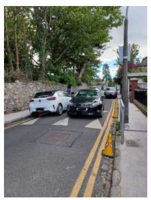
Image 11: Example of cars trying to pass at the front of Druncondra National School