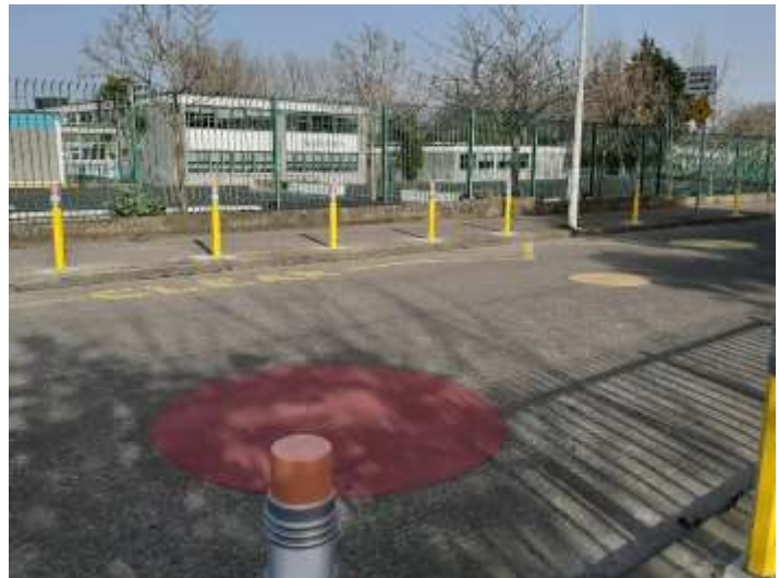
Image 8: Example Circle Road Surface Markings, Thornville Rd, Kilbarrack, D5

Colourful road markings consisting of yellow and red circles painted directly on Bannow Road in front of the school.