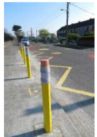
Image 5: Example Pencil Bollard on Footpath, Cromcastle, Kilmore, D5

All school vehicular entrances to remain unobstructed.