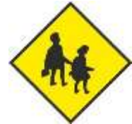
Image 7: School Ahead Warning Sign

Two new School Ahead Warning Signs to be mounted on new signposts on Bannow Road in both directions before the school. These will give drivers advance notice of a school crossing.