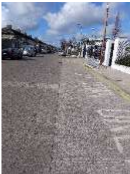
Image 3: Existing Set down Area in front of Broombridge Educate Together National School

The existing set down area in front of the school building will be built out to reduce the speed of cars coming into the area and to decrease the crossing length. The Path Buildout will increase the space for students going in and out of the school.