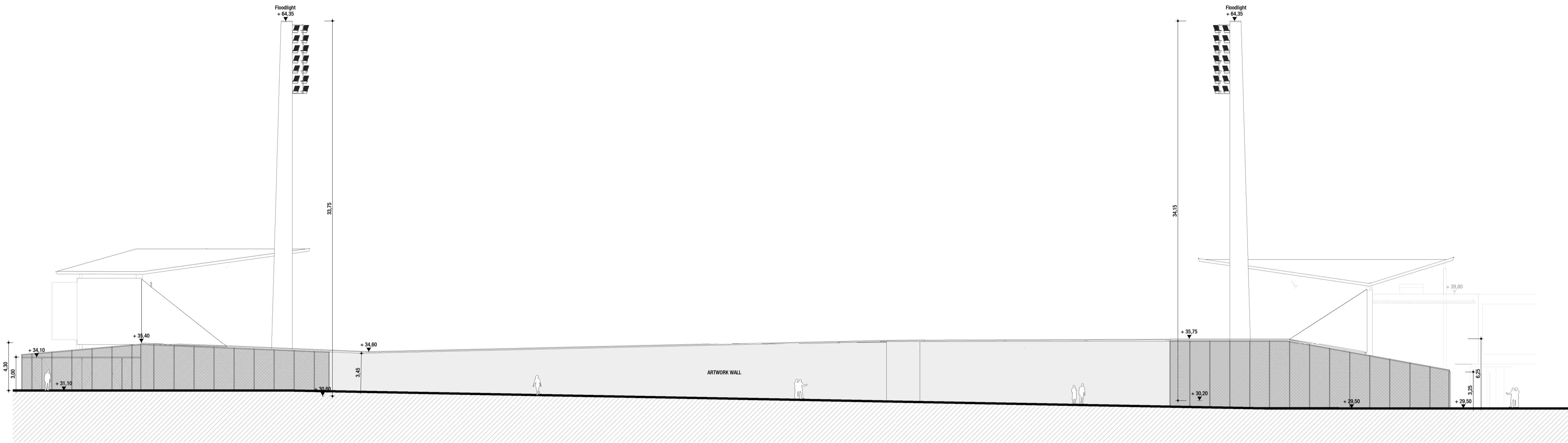
01 South Terrace - South Elevation Scale 1:200