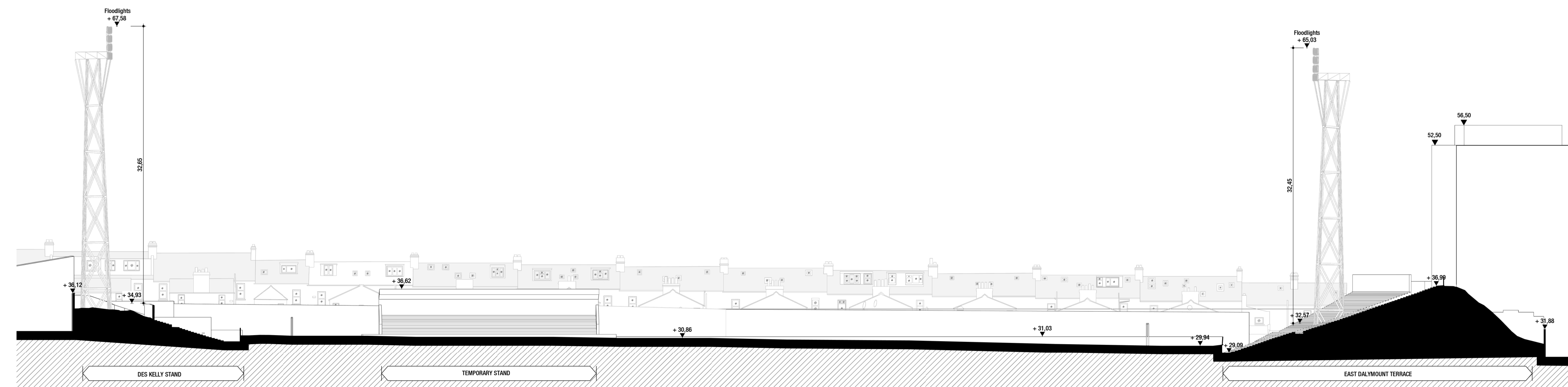
02 Existing Ga Section 02 Scale 1:300