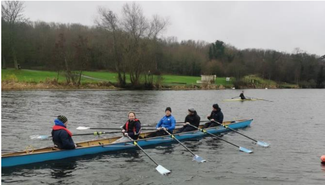
Figure 1 Beginner Community Rowing Lesson from the Municipal Rowing Centre, Dublin City Council

Rowing on the river Liffey is also tidal and therefore the pontoon will also allow for rowers who are based on the eastern stretch of the river access to the western section for longer rowing sessions. At present the window of opportunity for rowing in the eastern section is a maximum of 4 hours per day.