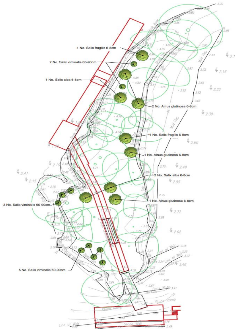
Figure 4 Sample of the proposed tree planting

The old steel footbridge on the island will be refurbished and reinstated for safer access. Currently there are many trees which are not healthy on the island. The removal of poor existing vegetation, pruning of existing healthy trees and the replanting of 25 new high-quality trees and growing shrubs all native to Ireland will be carried out as part of the project.