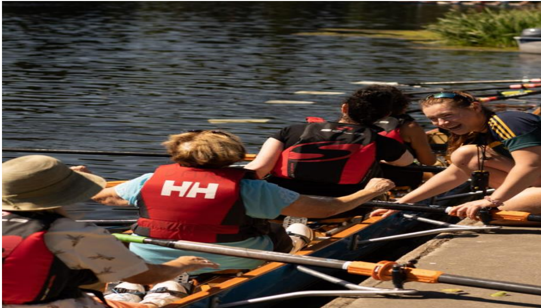
Figure 2 "Hers Outdoors" Community Event delivered by the Sports & Wellbeing Partnership, Dublin City Council.