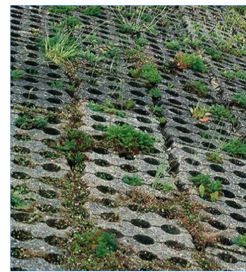
EXAMPLE OF DYCEL 150 CONCRETE MATTRESS UNITS