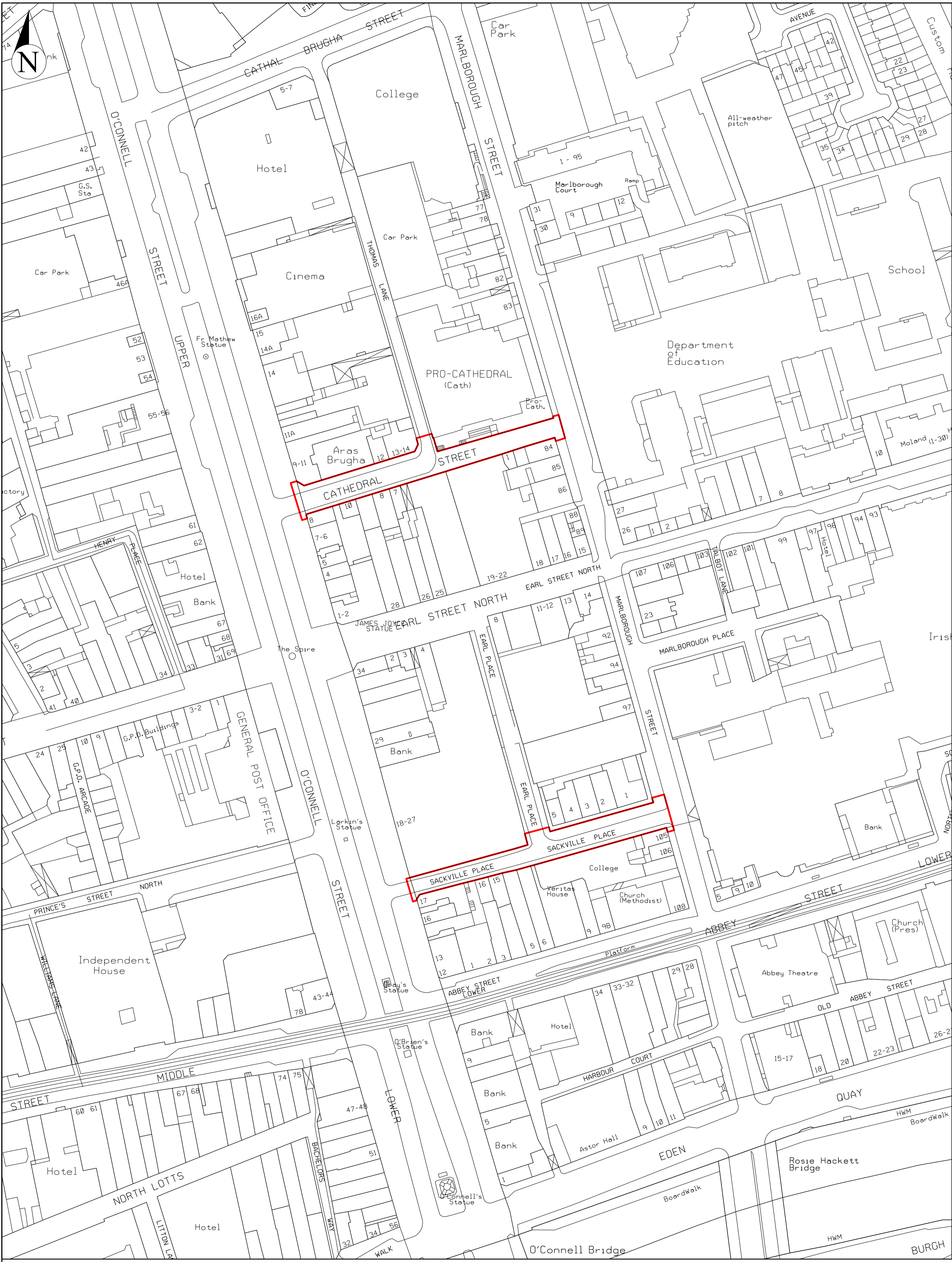
Site Location Scale 1:1000 Copyright © Ordnance Survey Ireland. Licence number 2017/22/CCMA/ Dublin City Council.