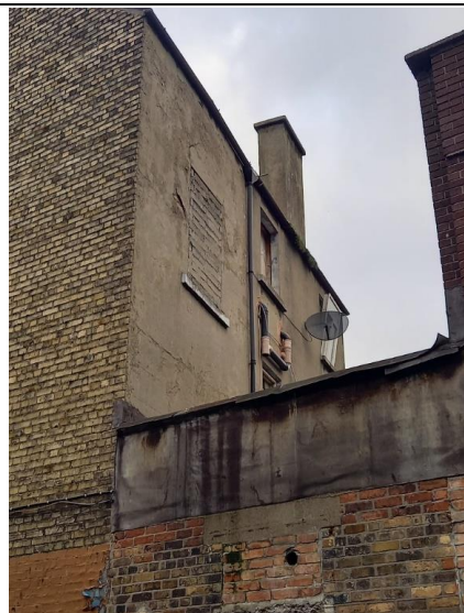
Fig. 4: Rear rendered elevation