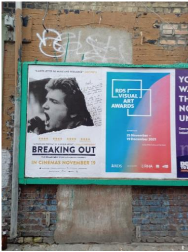
Fig. 5: Blocked up side door to Henry Place.