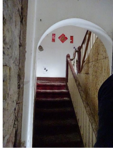
Fig. 6: Staircase viewed from first floor