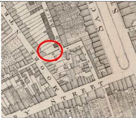
Fig. 9: Rocque's map of Dublin 1756