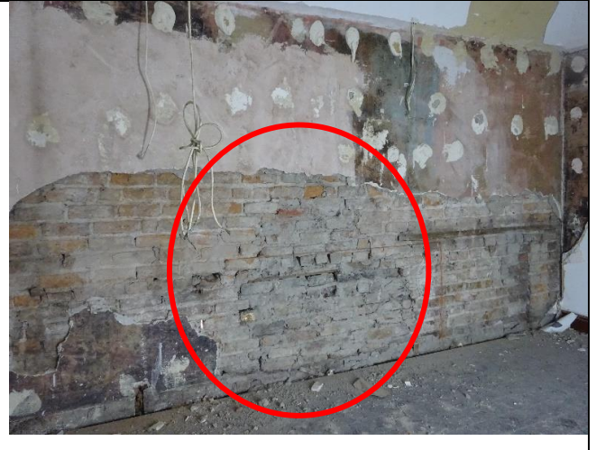
Fig. 8: Second Floor rear room of No. 10 with repaired brick work in the party wall to No. 11 as evidence of a 'creep hole' made during 1916