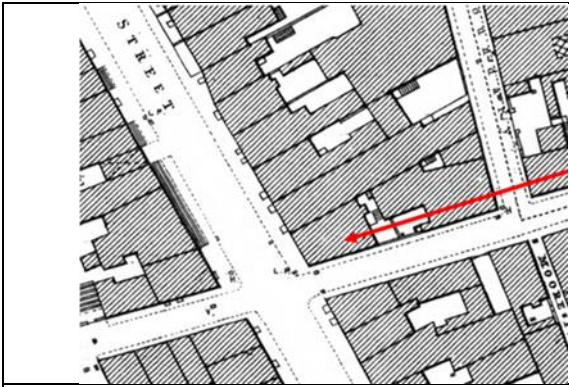
Fig. 11: Dublin OS sheet XVIII.47, 1891