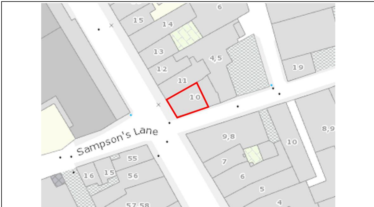
Fig. 2: 10 Moore Street, Dublin 1: extent of Protected Structure status and curtilage outlined in red.

The extent of protected structure status & curtilage is shown on the map below in red.