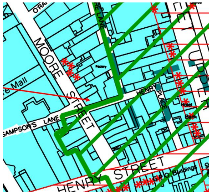
Figure 1: Site Location and Land Use Zoning

The subject structure is located in an area zoned Z5, the objective of which is: “To consolidate and facilitate the development of the central area, and to identify, reinforce, strengthen and protect its civic design character and dignity”.