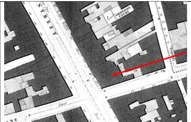
Fig. 10: Dublin OS sheet 14, 1847