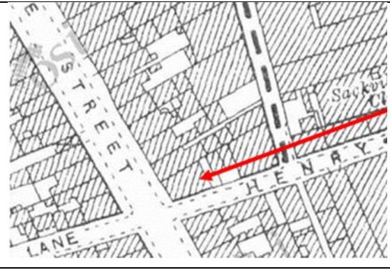
Fig. 12: Dublin OS 25" map, c. 1915