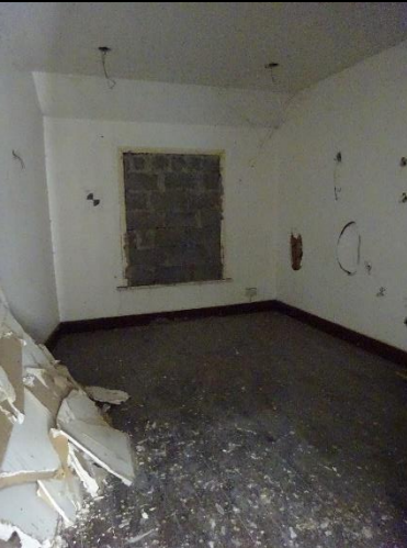
Fig. 7: Second Floor front room with timber floor boards and blocked up window opening