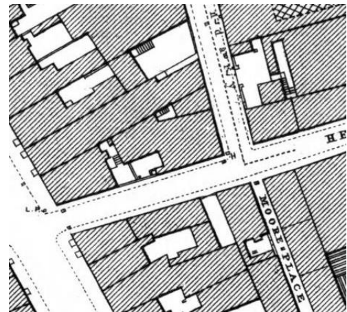
Fig. 8: Dublin OS sheet XVIII.47, 1891