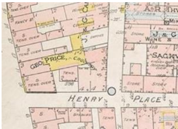
Fig. 9: Charles Goad, Insurance Plan of the City of Dublin, 1893