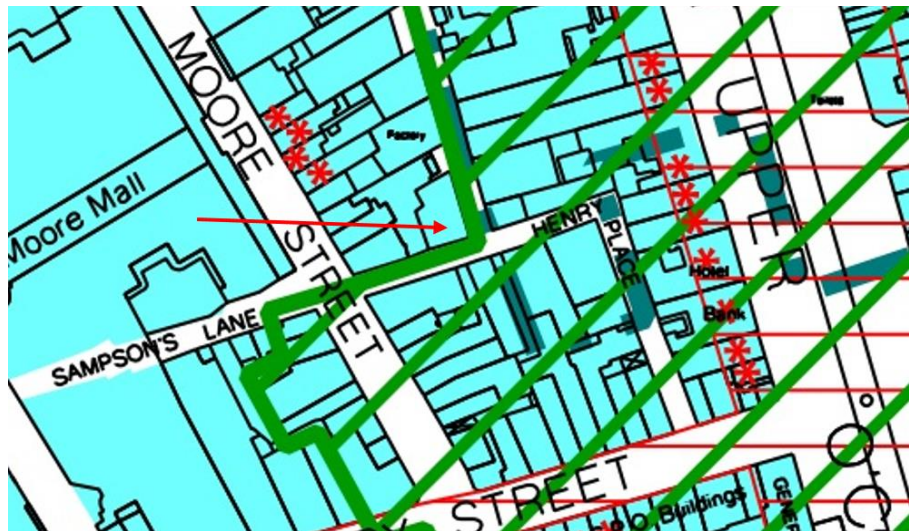
Fig. 1: Site Location and Land Use Zoning

The subject structure is located in an area zoned Z5, the objective of which is “To consolidate and facilitate the development of the central area, and to identify, reinforce, strengthen and protect its civic design character and dignity”.