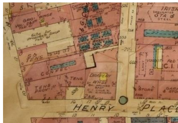
Fig. 10: Charles Goad, Insurance Plan of the City of Dublin, revised 1961