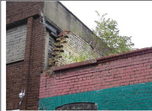
Fig. 5: 17/18 Henry Place, upper section of western party wall to 16 Henry Place.