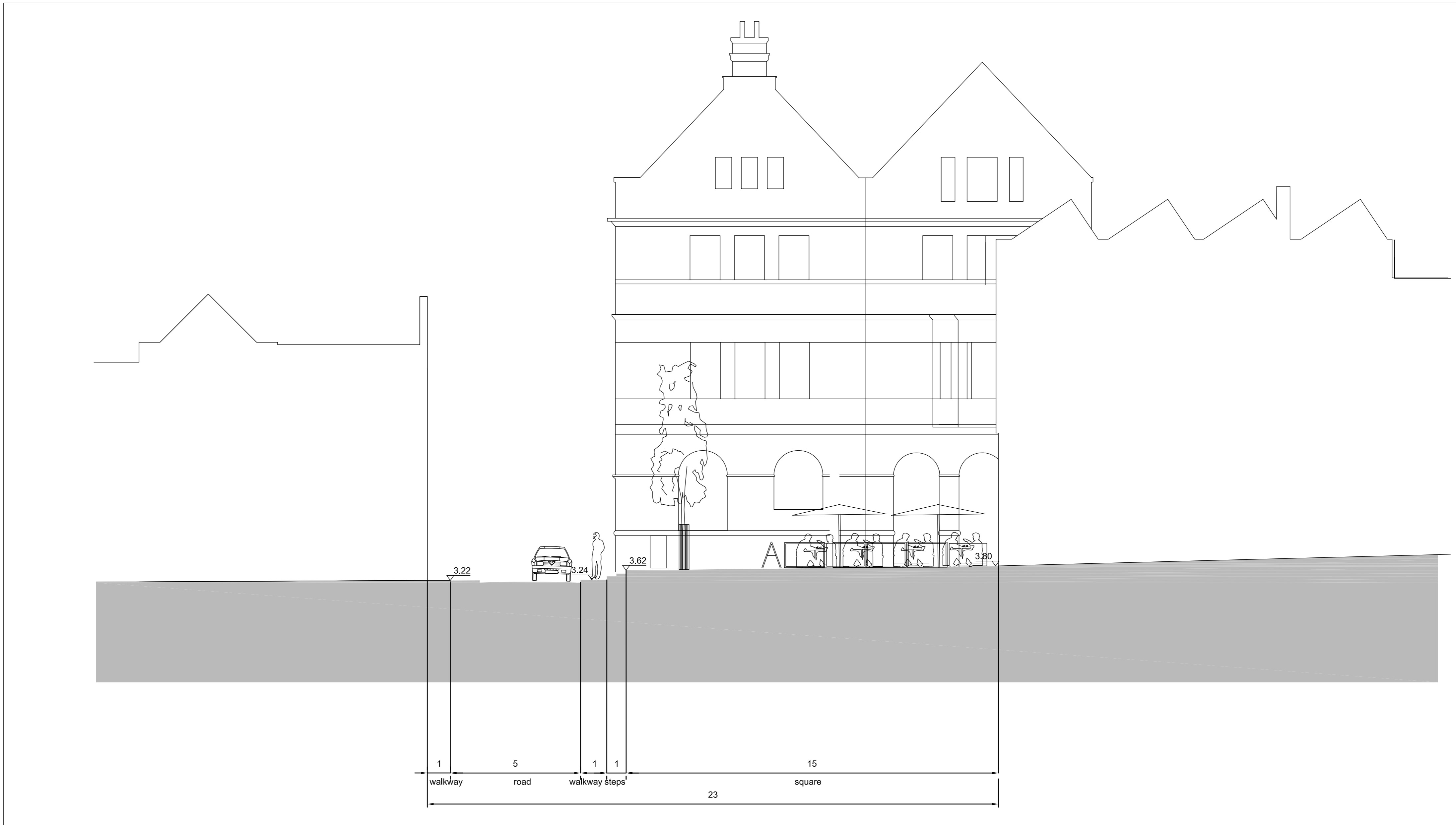
Section A, Existing situation 1:100