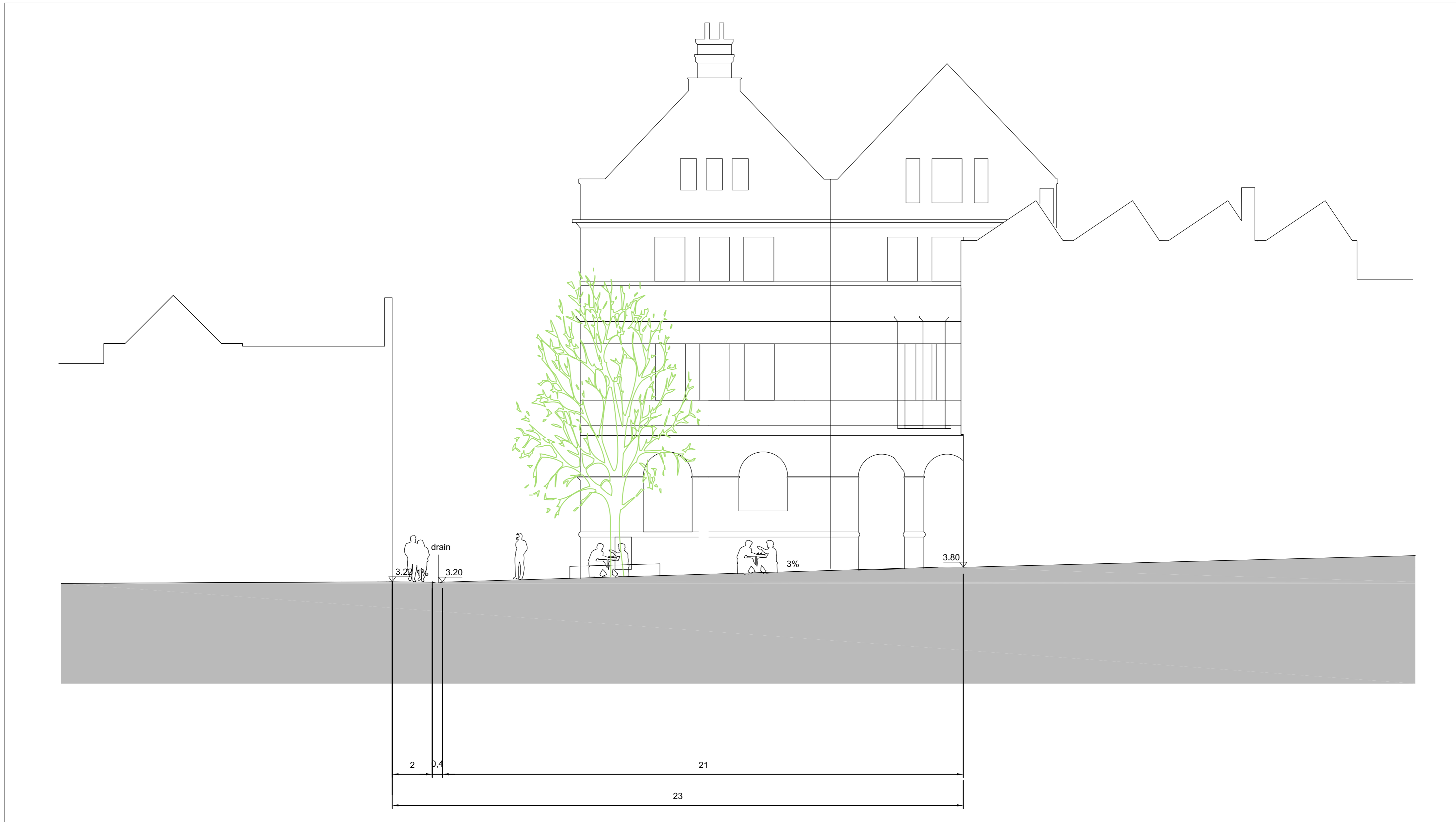
Section A, New situation 1:100