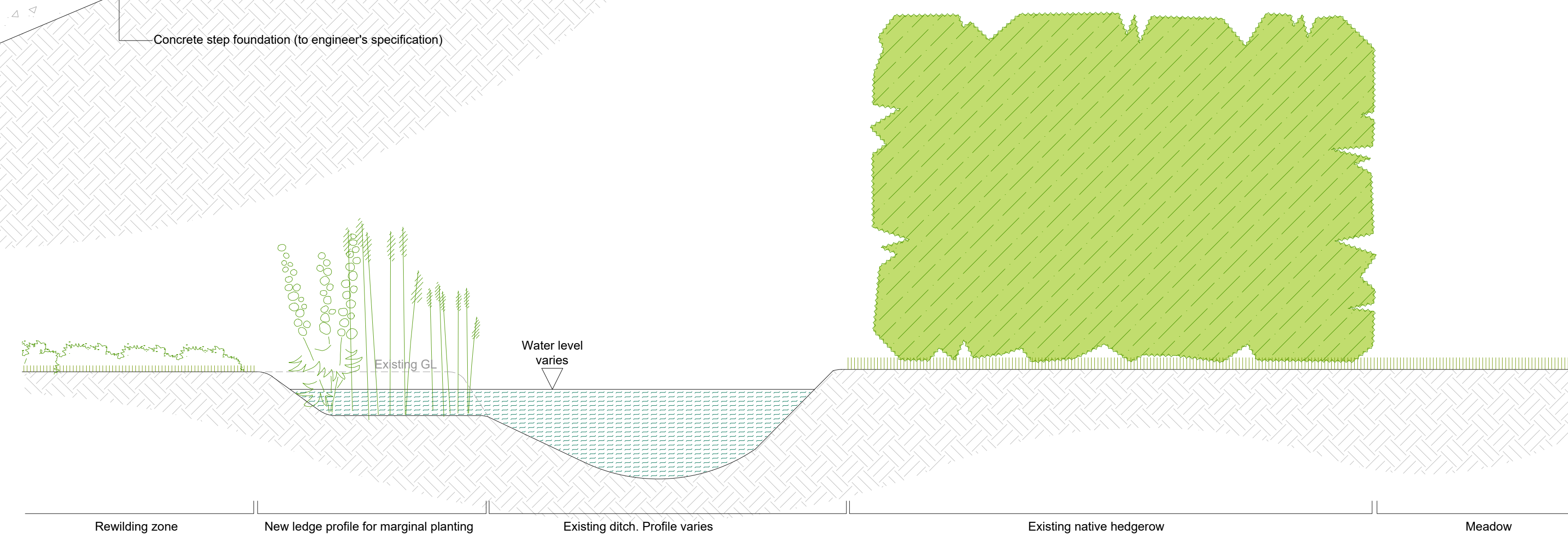
TYPICAL DITCH DETAIL Scale 1:20 @A1