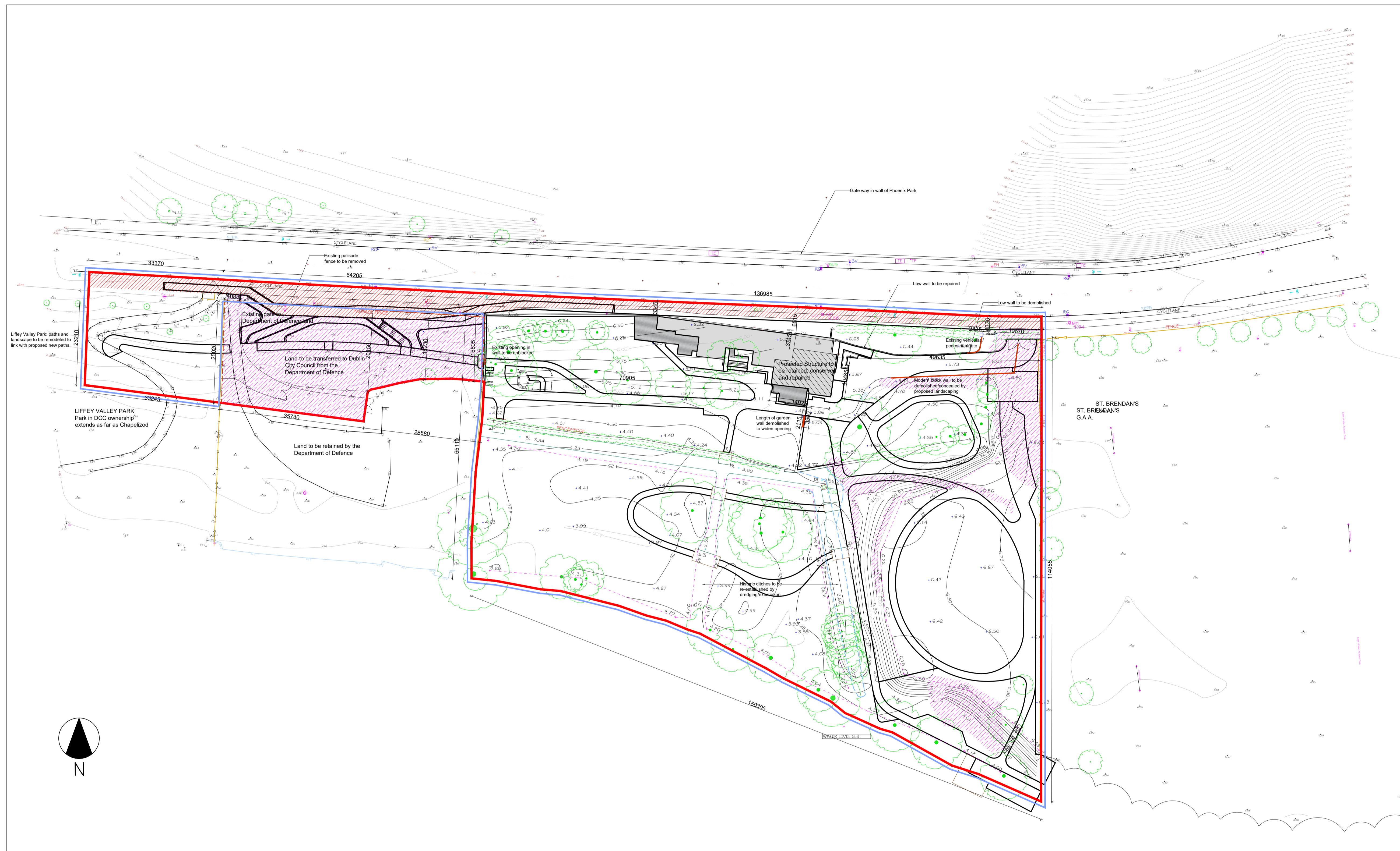
1 SITE PLAN 1:500