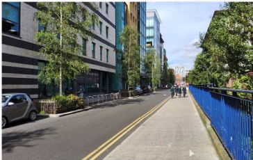
Street tree planting on James Joyce Street - Completed 2020