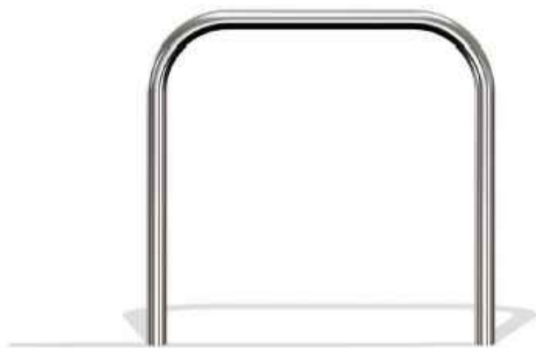
05 CYCLE STAND 100No. NTS