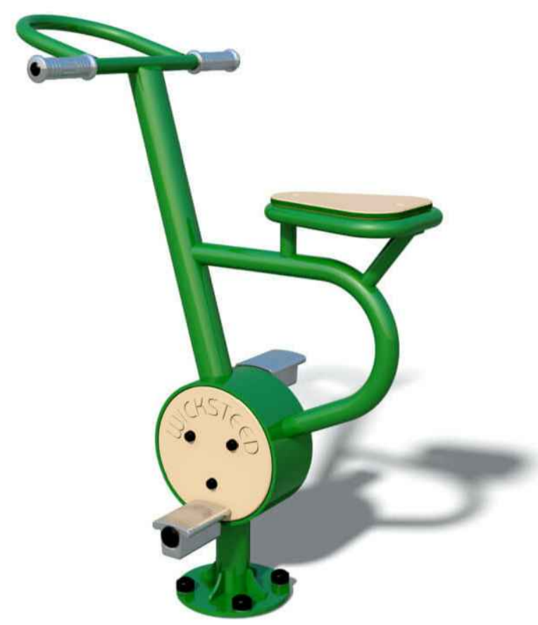
01 BIKE NTS