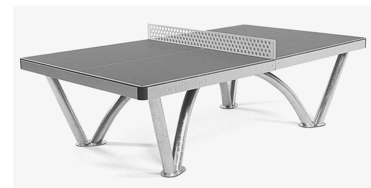
06 TABLE TENNIS TABLE NTS