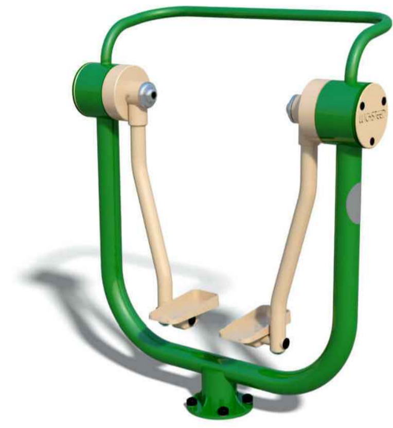
02 SPACE WALKER NTS