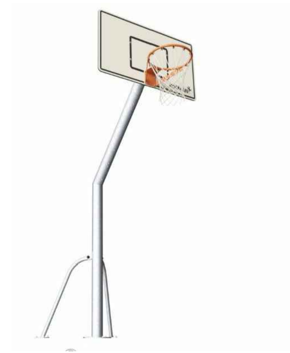
06 BASKETBALL HOOP NTS

NOTE: These are indicative of the elements planned for the Park. They will be subject to change as part of the tender & procurement process.