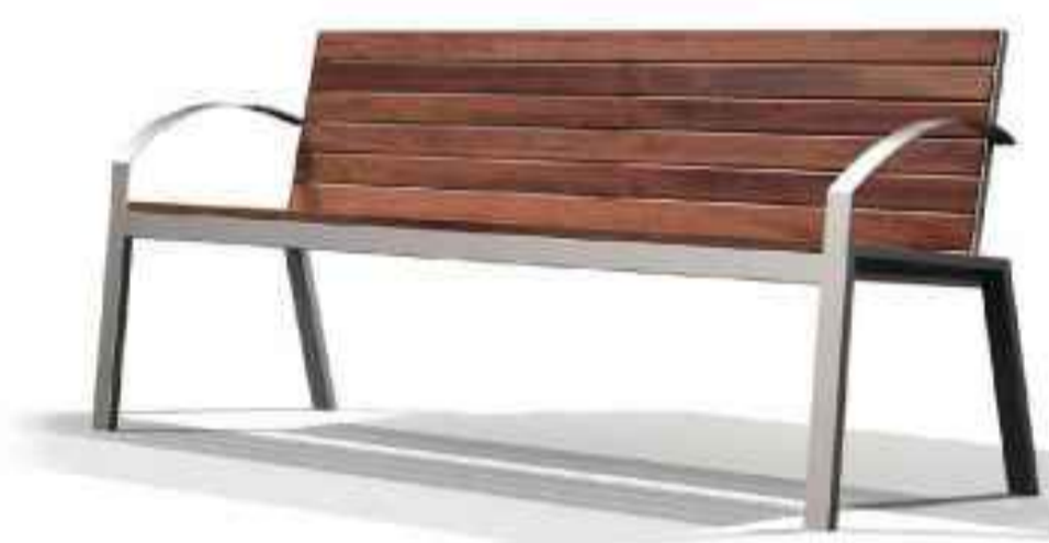
04 PARK BENCH 6No. NTS