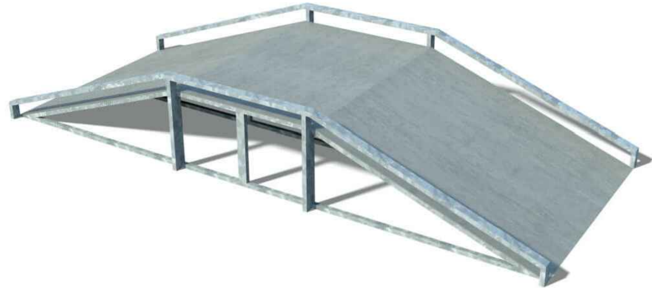
01 DRIVEWAY NTS

NOTES: This drawing is the copyright of Dublin City Council. It must not be copied or reproduced without written consent. Only figured dimensions are to be taken from this drawing. All contractors must visit the site and be responsible for taking and checking all dimensions related to the works shown on this drawing.