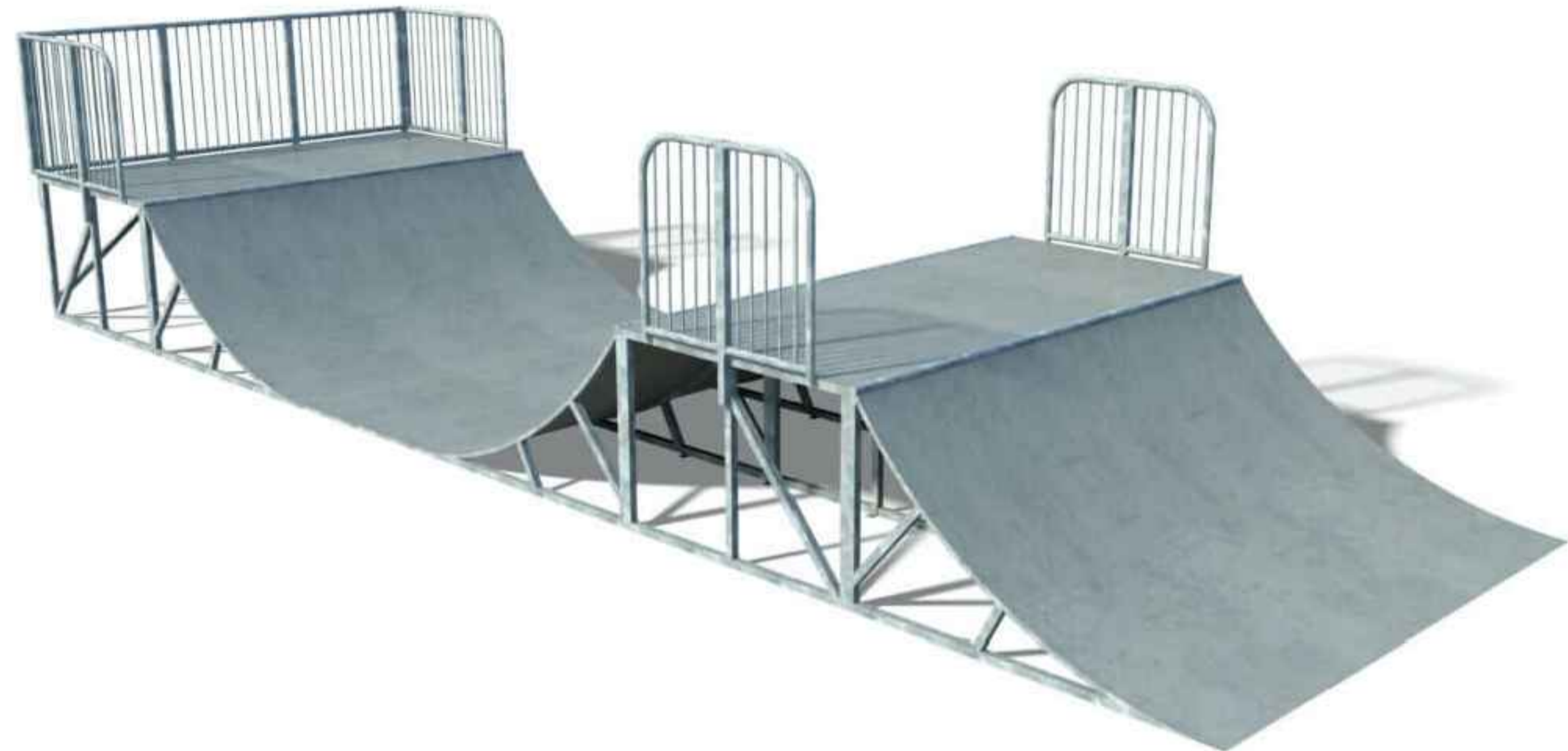
03 HALF PIPE AND QUATER PIPE NTS

NOTE: These are indicative of the elements planned for the Skate Park. They will be subject to change as part of the tender & procurement process.