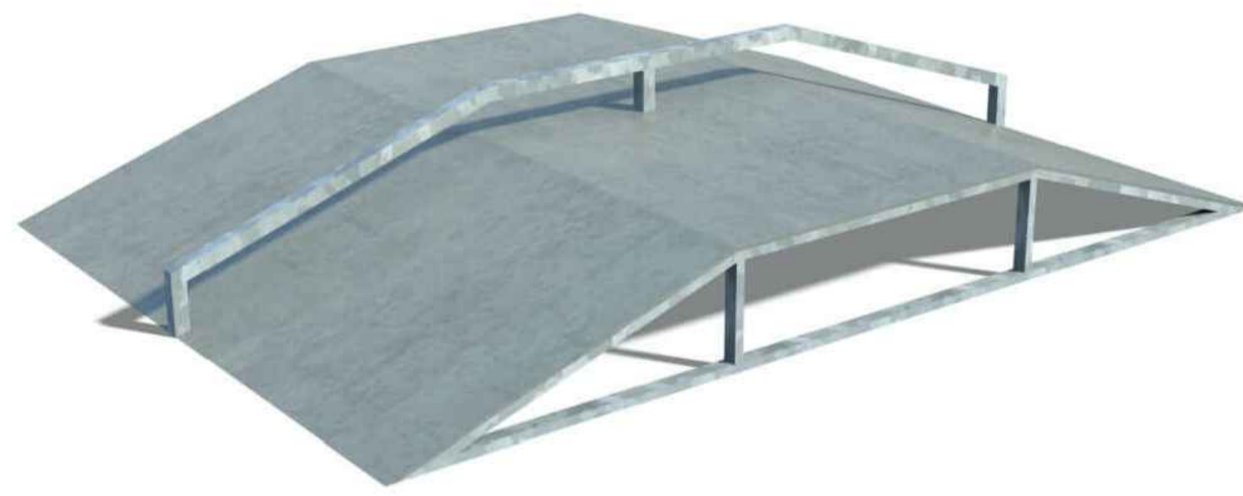
02 FUNBOX NTS

NOTE: These are indicative of the elements planned for the Skate Park. They will be subject to change as part of the tender & procurement process.