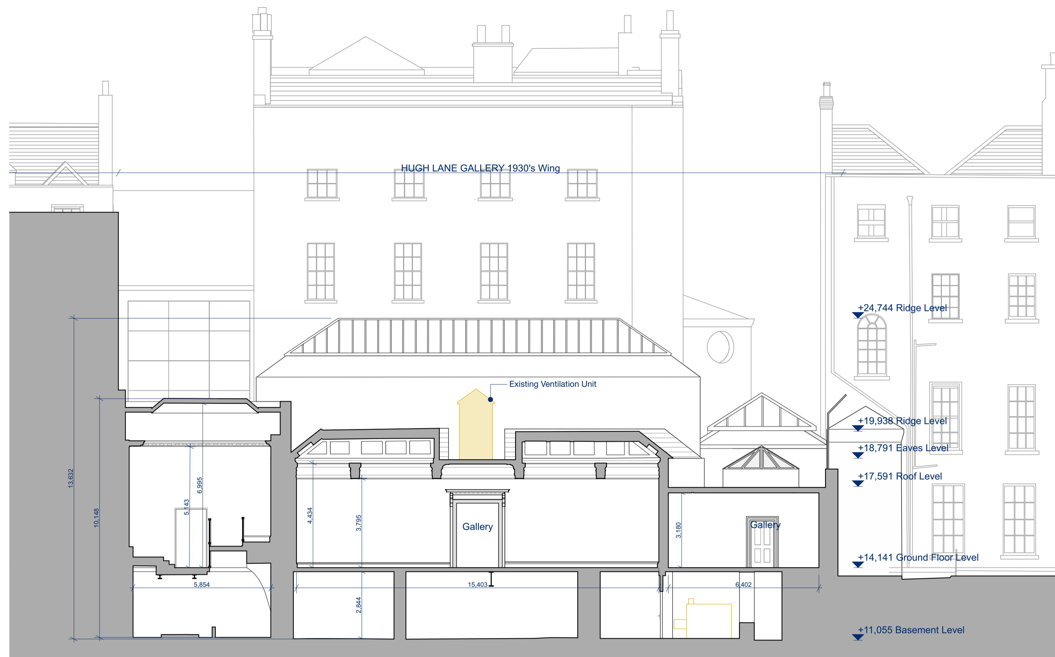
SECTION CC - EXISTING + FABRIC REMOVAL 1:100