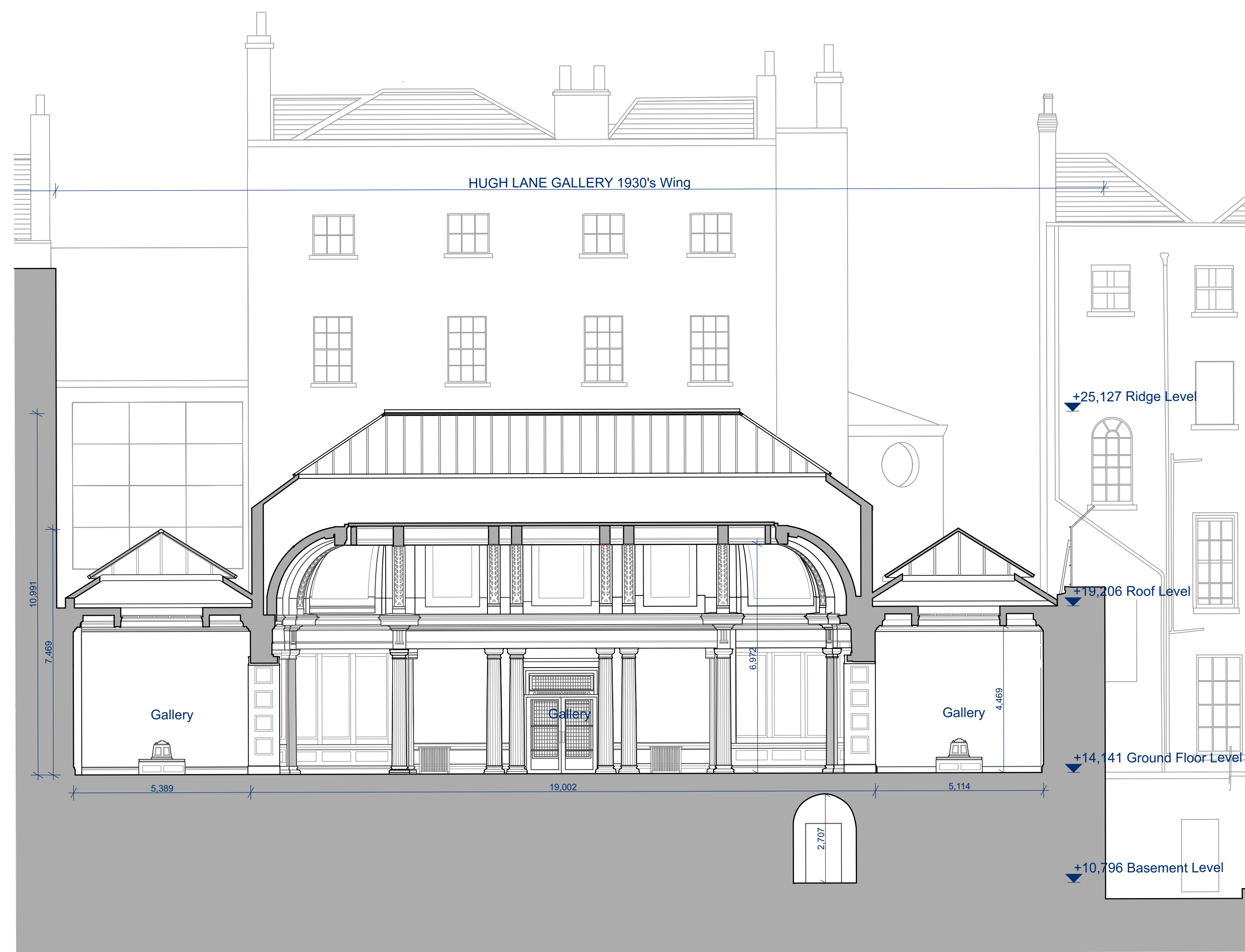
SECTION AA - EXISTING + FABRIC REMOVAL 1:100