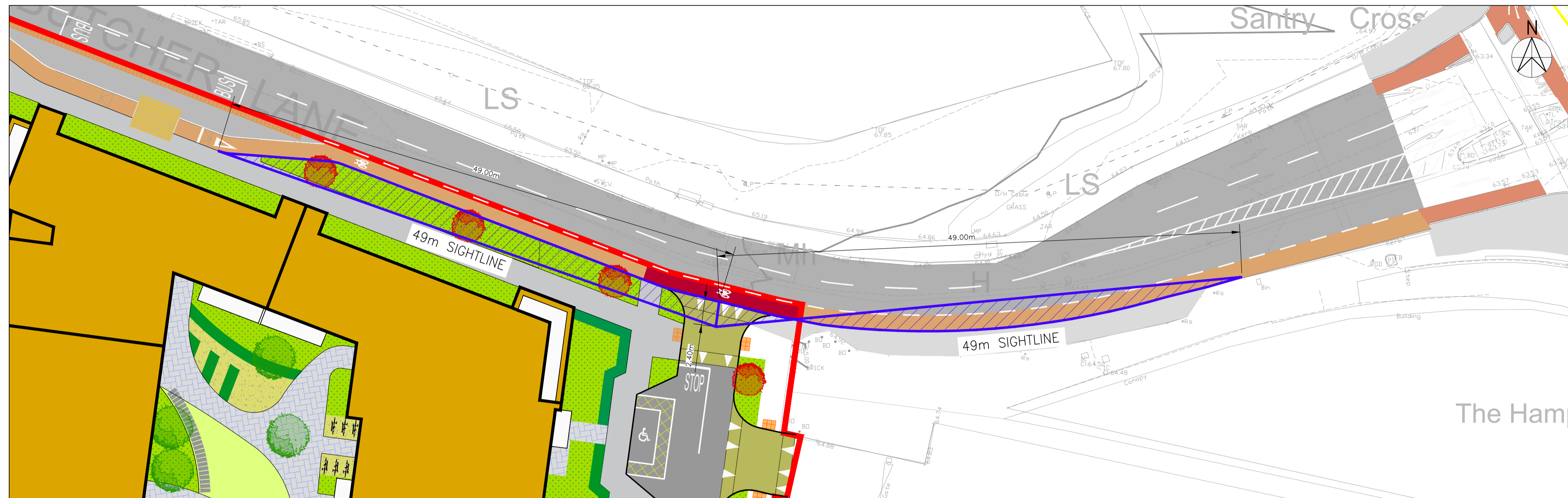
PLAN OF SIGHTLINES FOR JUNCTION NO.1 SCALE: 1:250