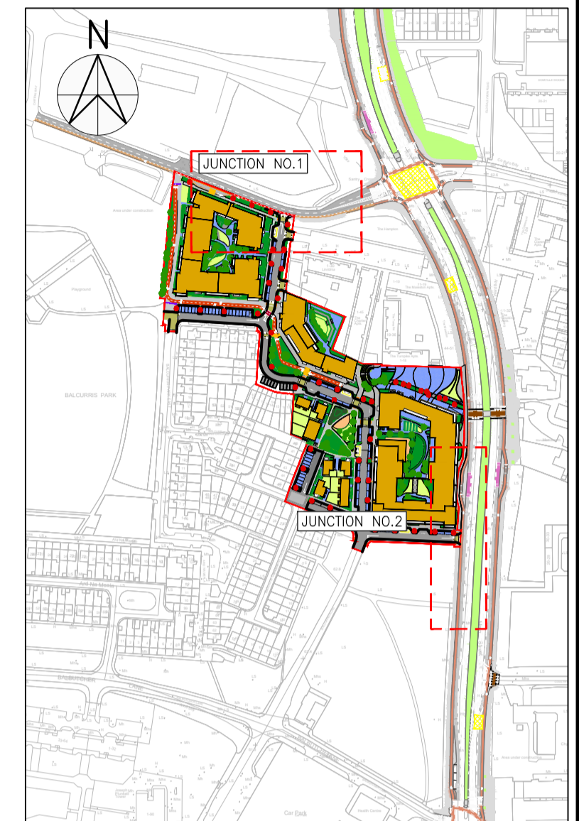
KEYPLAN SCALE: N.T.S.