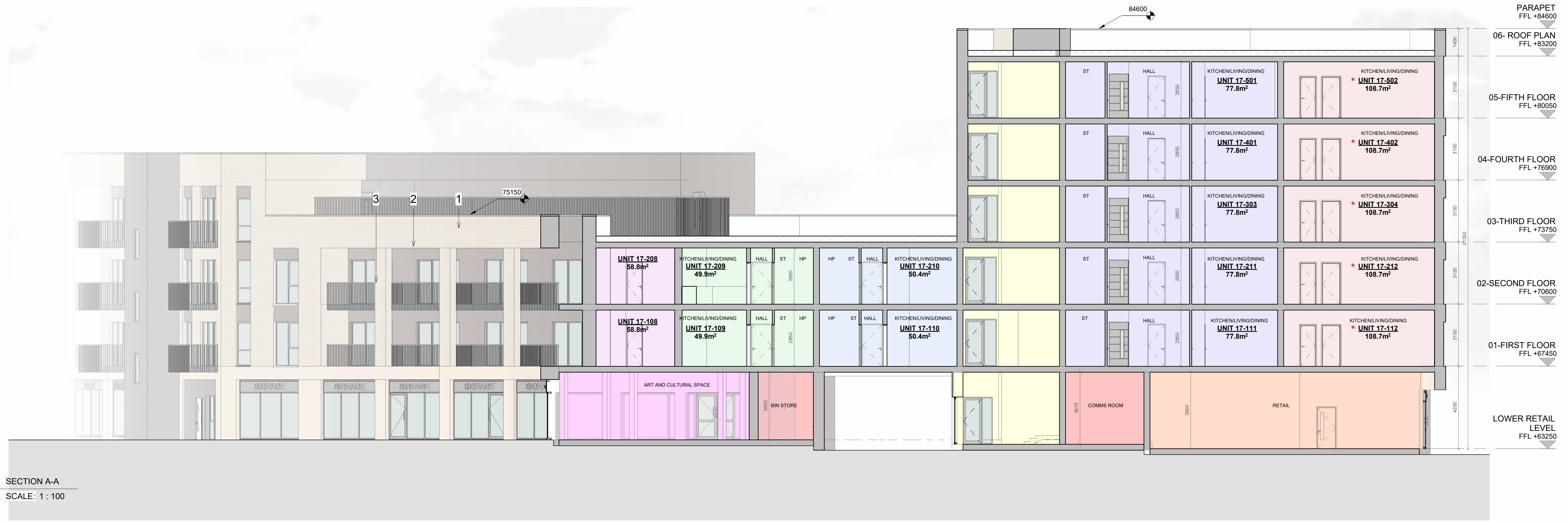
SECTION A-A SCALE: 1 : 100