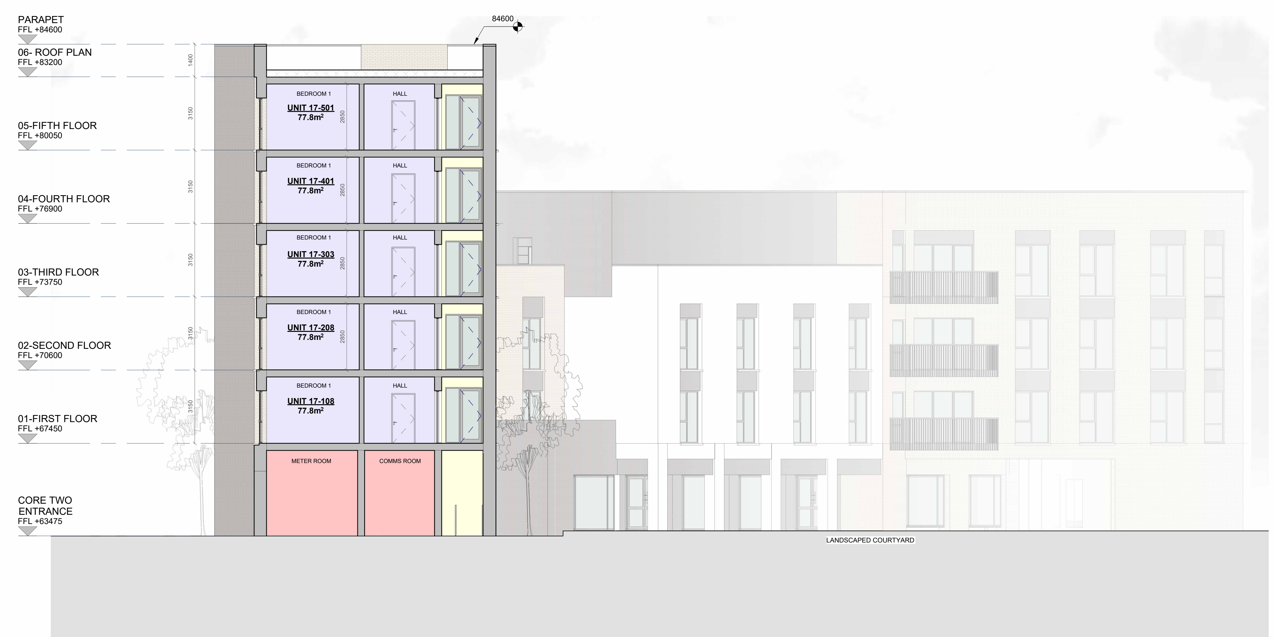
SECTION B-B SCALE: 1 : 100