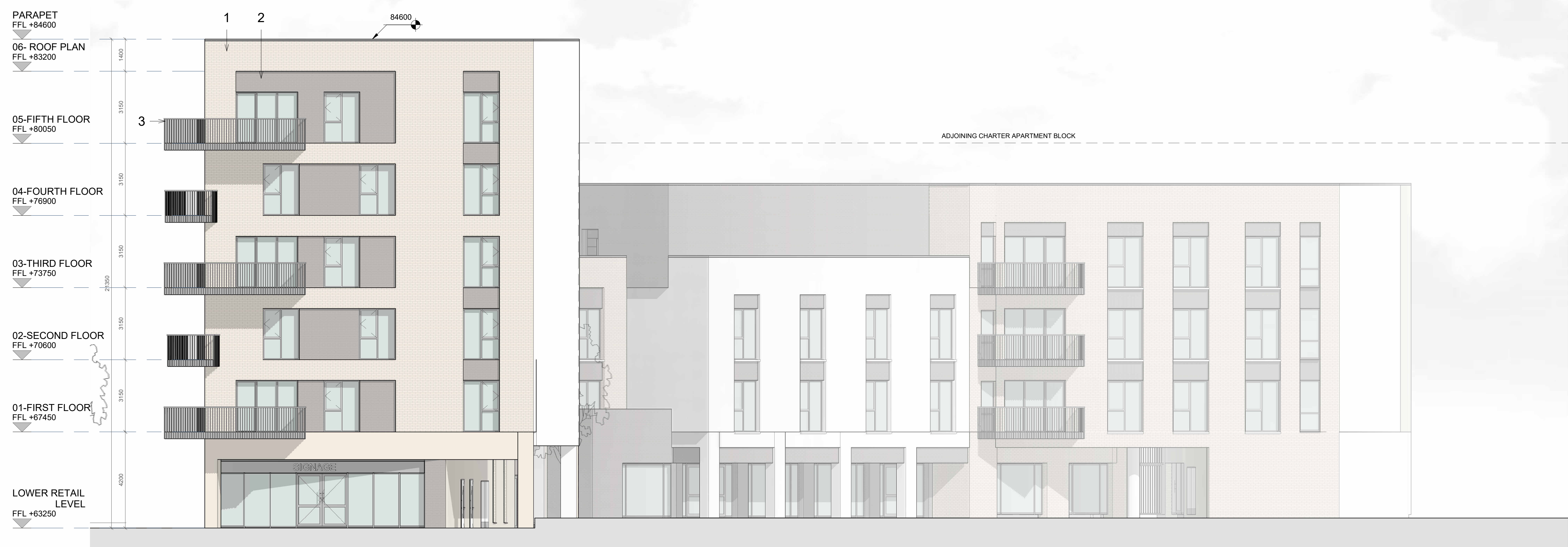
SOUTH ELEVATION SCALE: 1 : 100