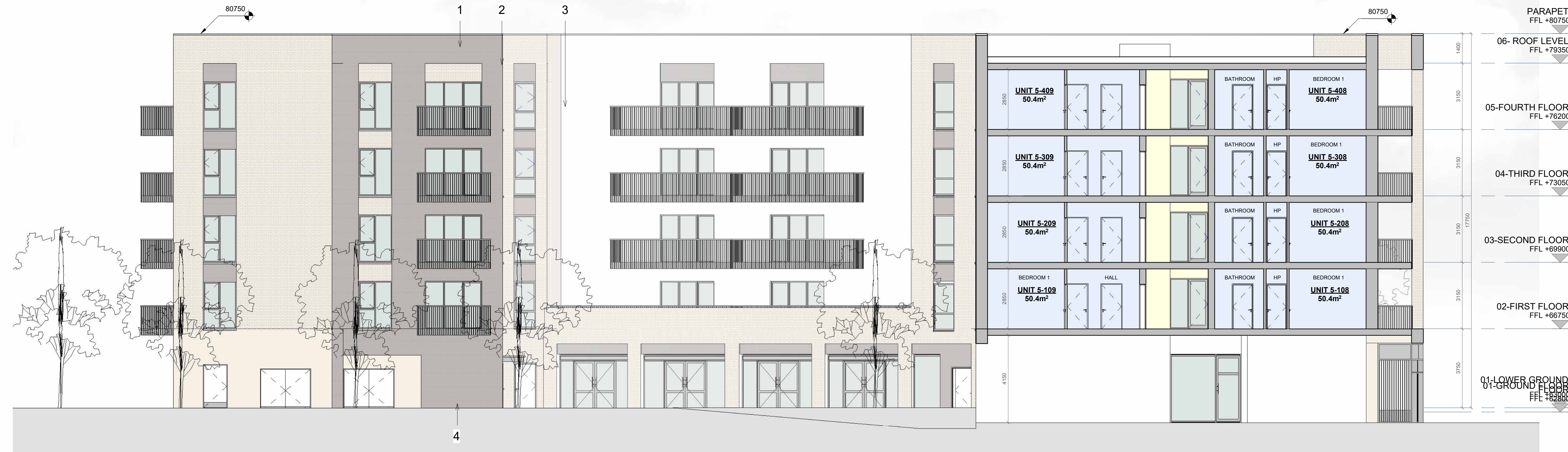
SECTION D-D SCALE: 1:100