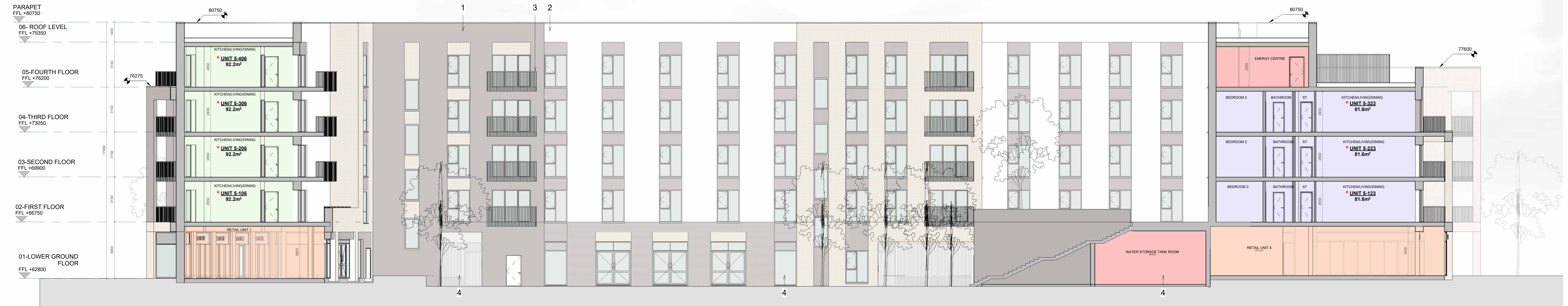
SECTION B-B SCALE: 1:100