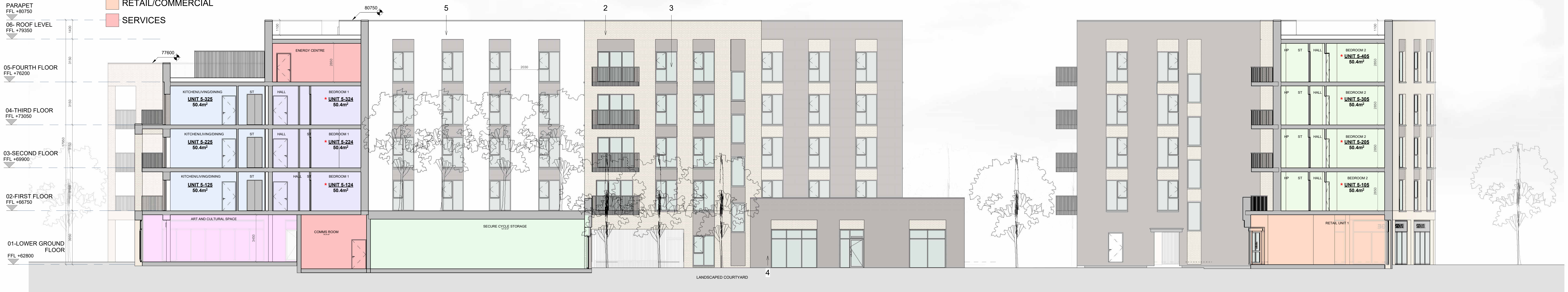
SECTION A-A SCALE: 1 : 100