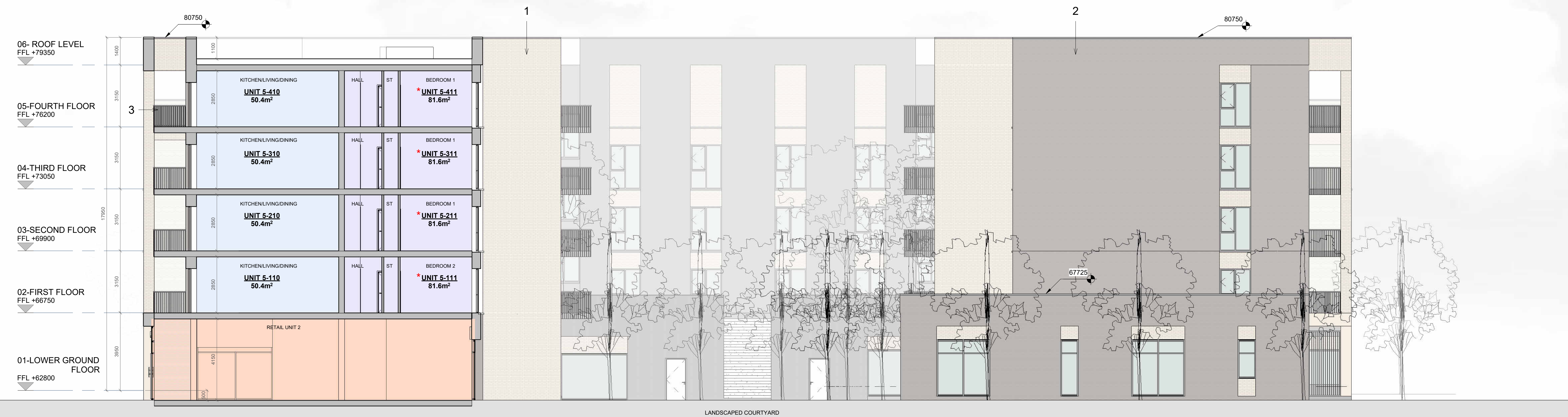
SECTION C-C SCALE: 1 : 100