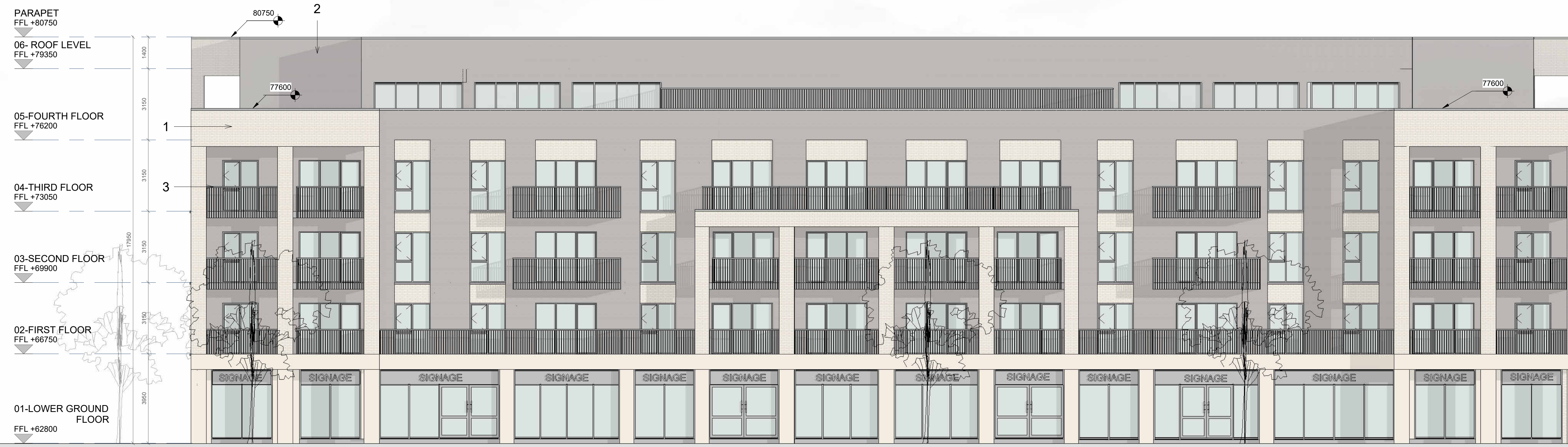
SOUTH ELEVATION SCALE: 1 : 100