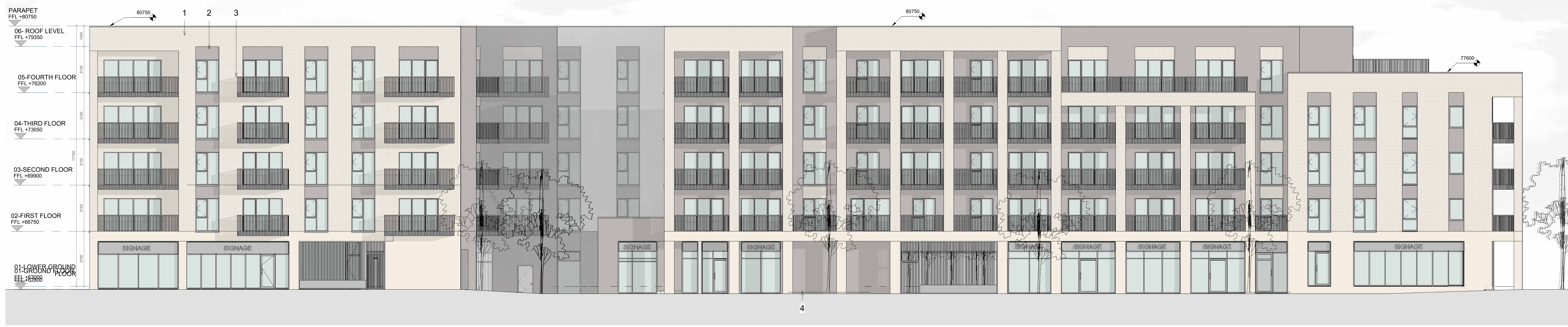
WEST ELEVATION SCALE: 1 : 100