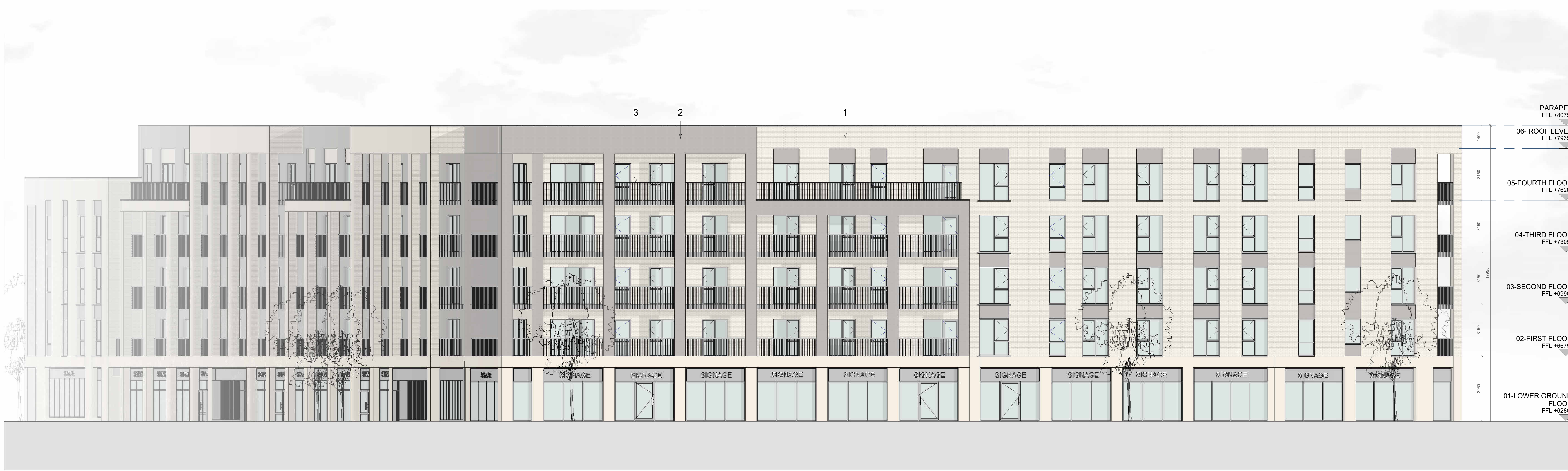
NORTH ELEVATION SCALE: 1 : 100