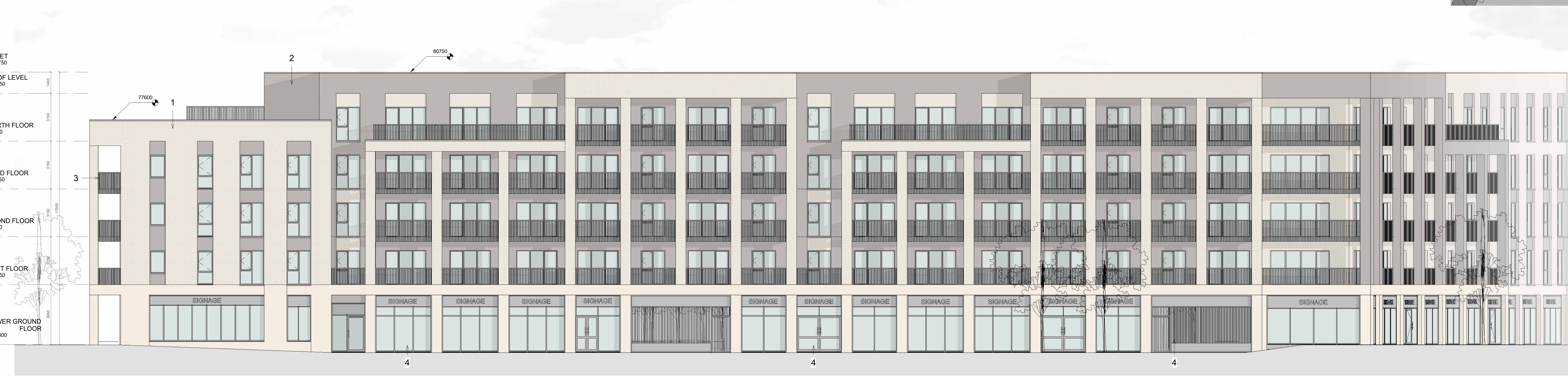
EAST ELEVATION SCALE: 1 : 100