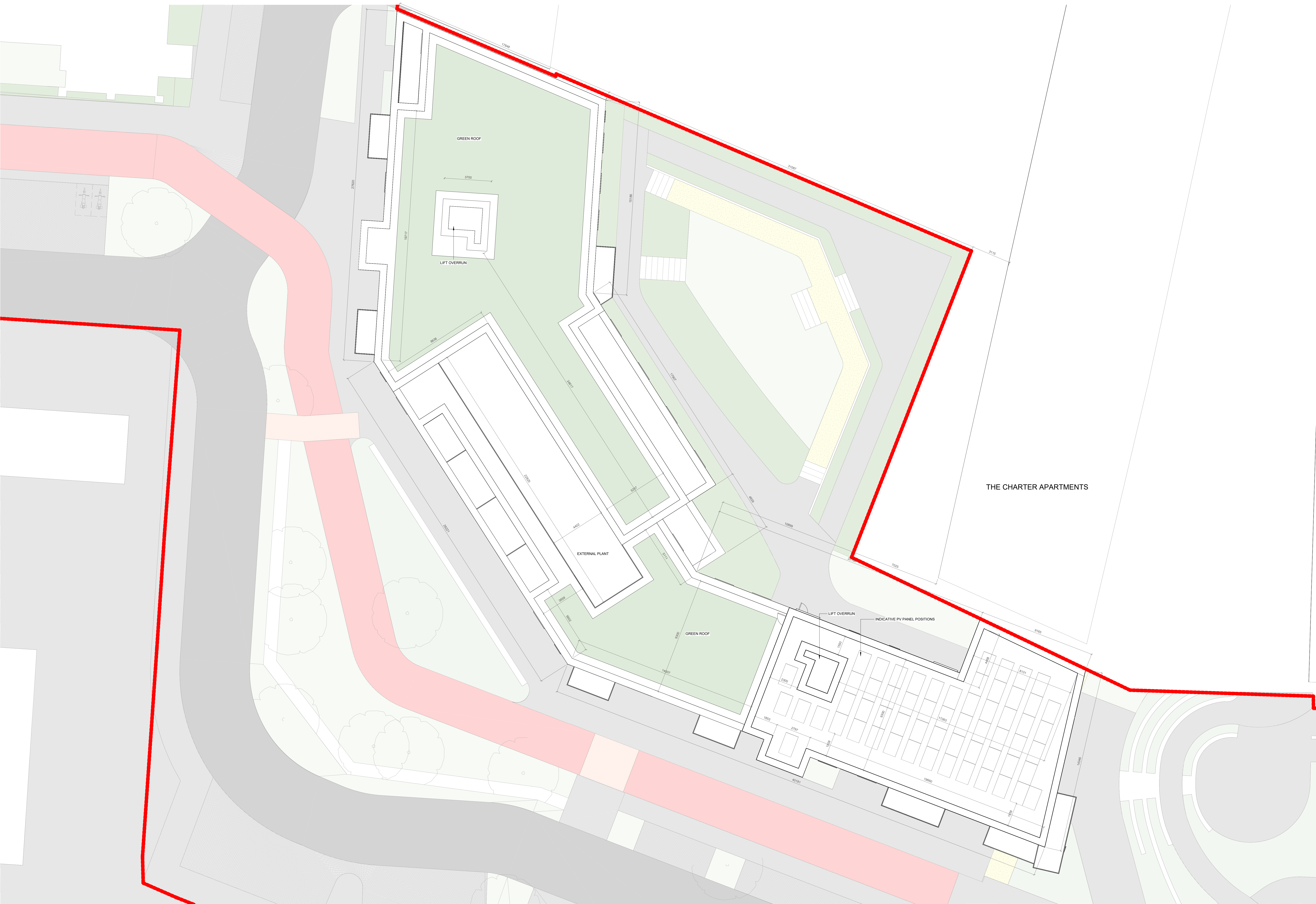
06- ROOF PLAN SCALE: 1 : 100

MCORM ARCHITECTURE AND URBAN DESIGN No. 1 Grantham Street, Dublin 8 D08 A8F7 Tel: +353 (0)1 478 8700 Block 6, Central Business Park Tallinn, County Offaly E32 18R9 Tel: +353 (0)1 932 3807 website: www.mccorm.com email: arch@mcorm.com