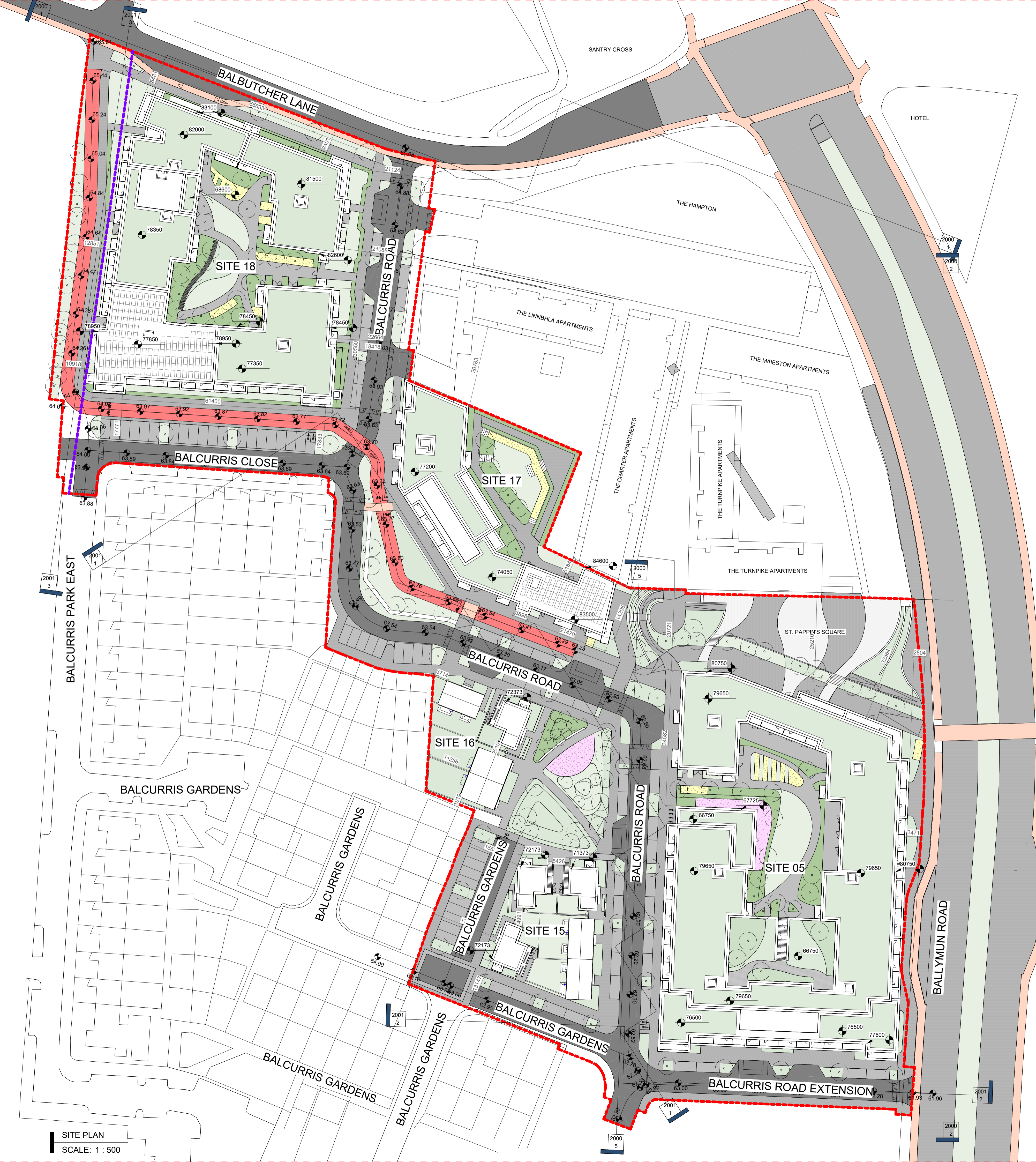
SITE PLAN SCALE: 1 : 500