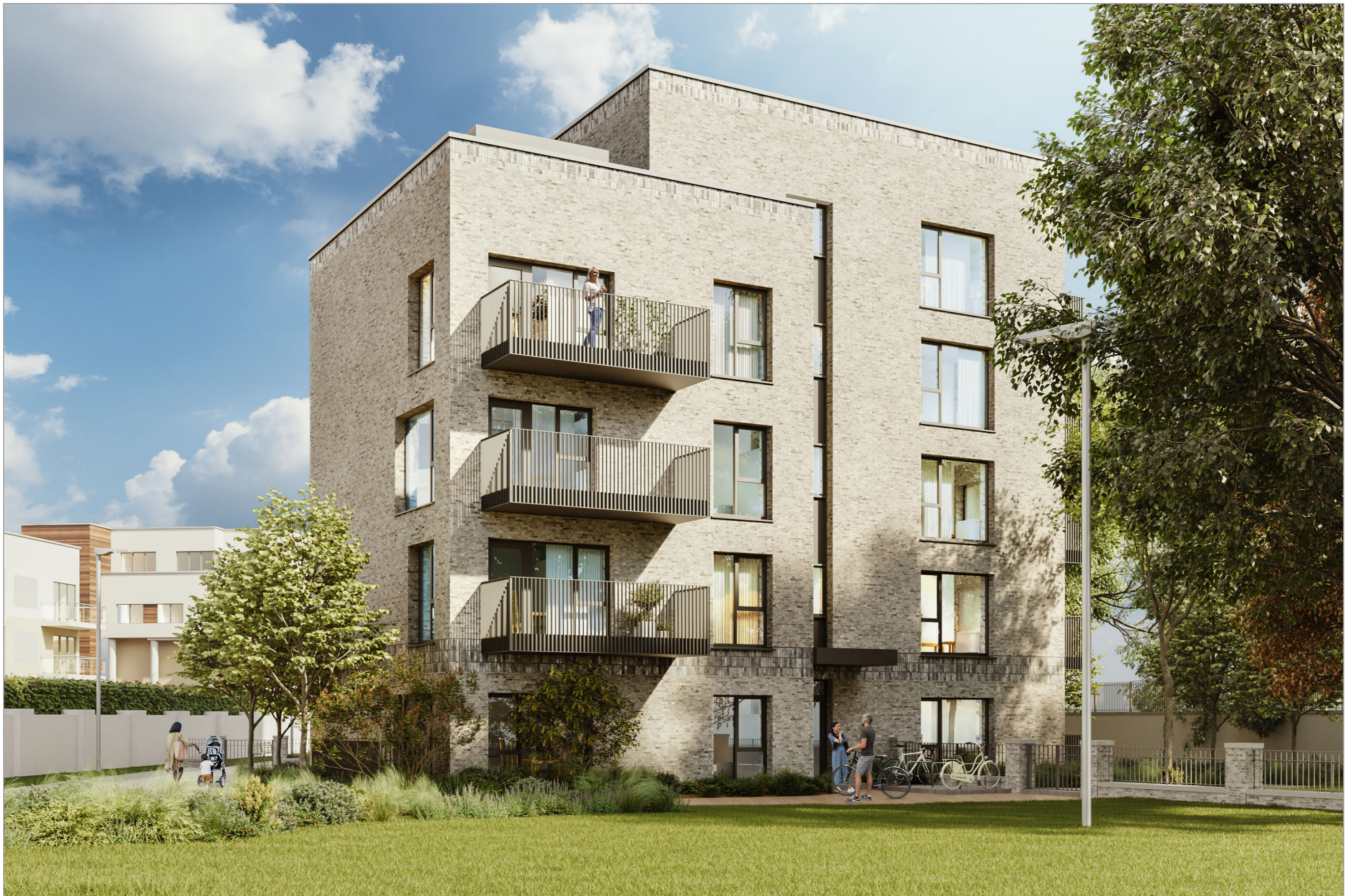
Location CGI 03