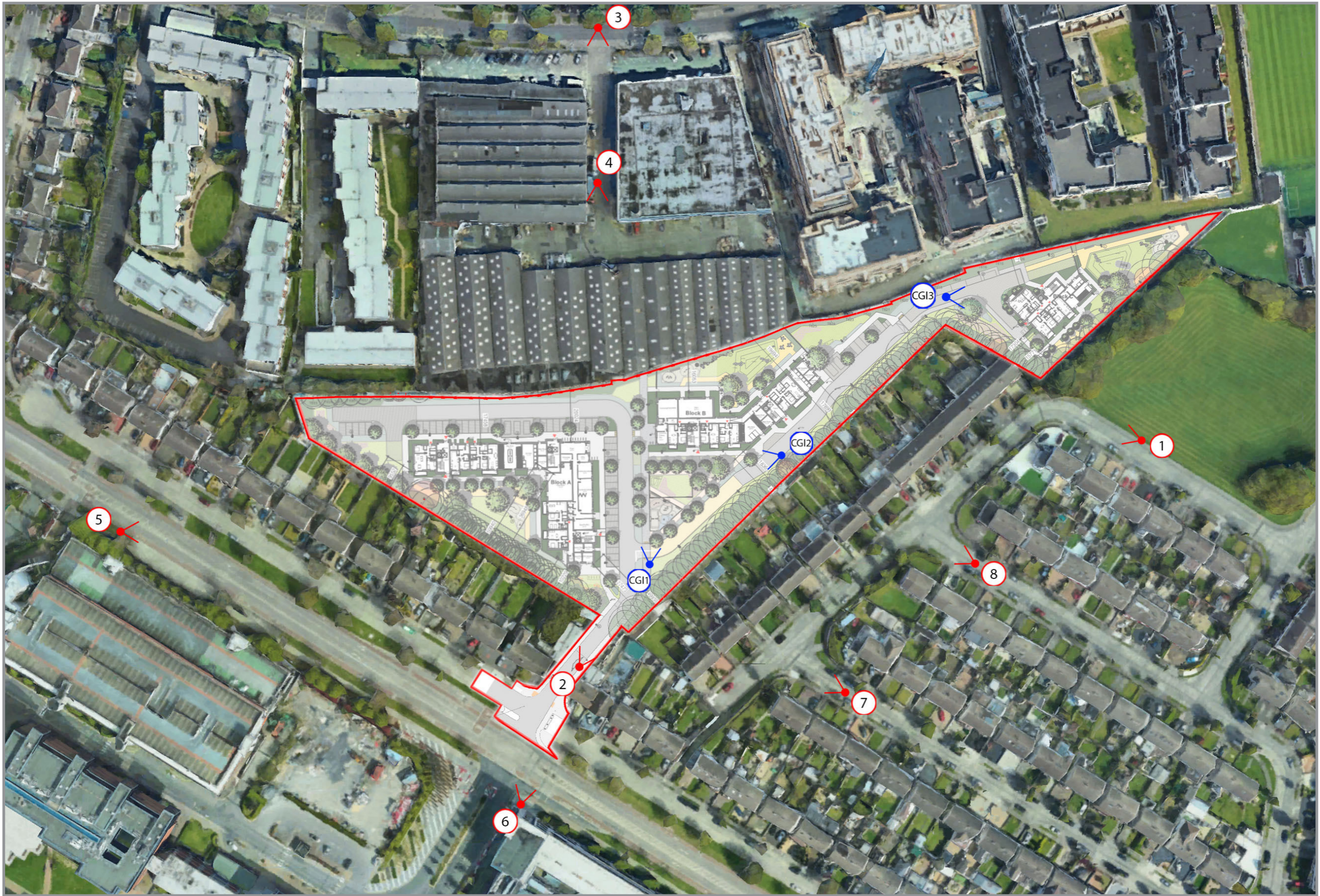
View Location Map

This map is for view location purposes only. Please refer to Architects drawings for site layout and redline boundary.