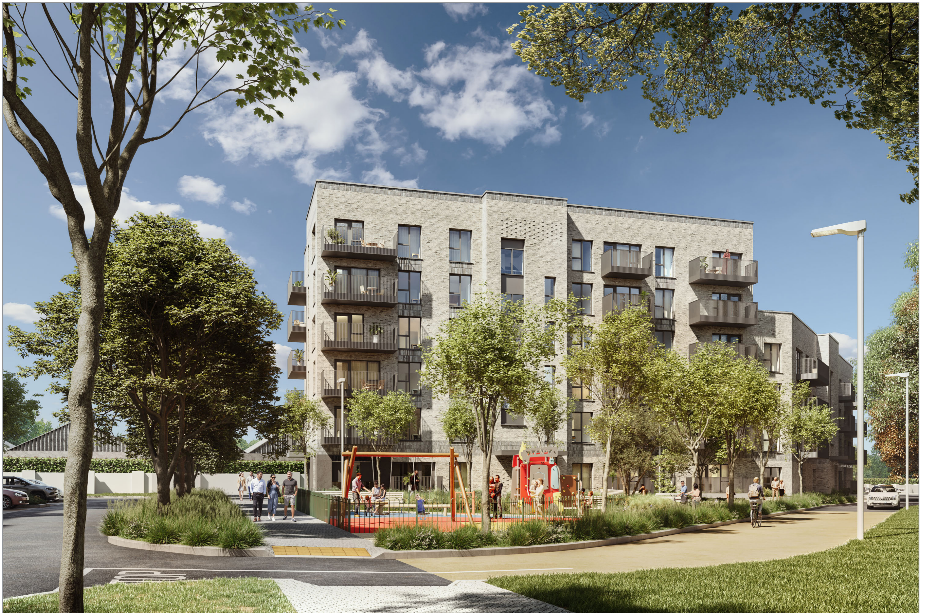
Location CGI 01