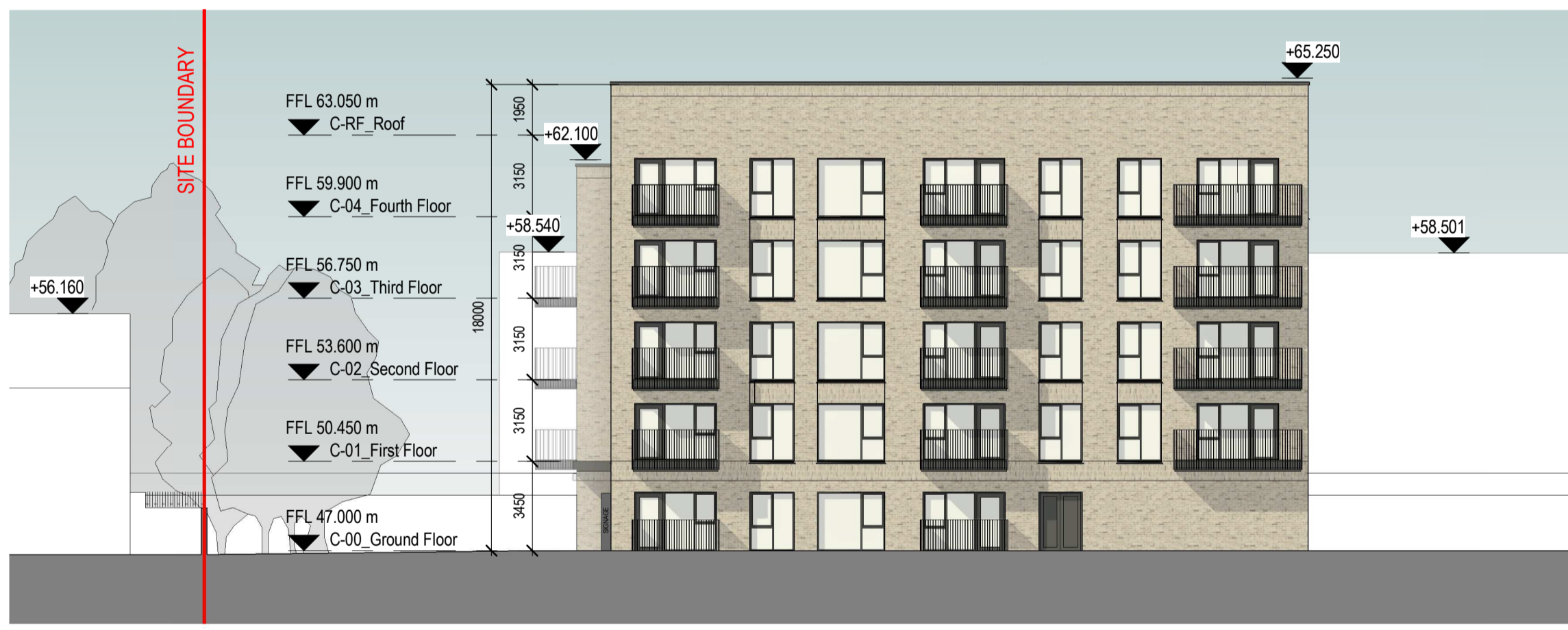
2 Block C - South Elevation with Context 1:200