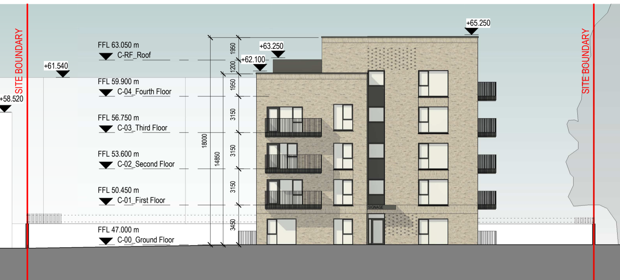
4 Block C - West Elevation with Context 1:200