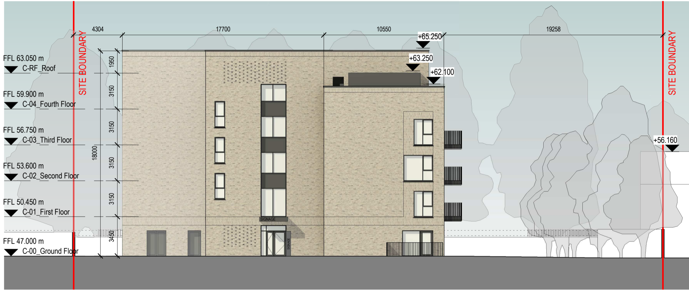
1 Block C - North Elevation with Context 1:200