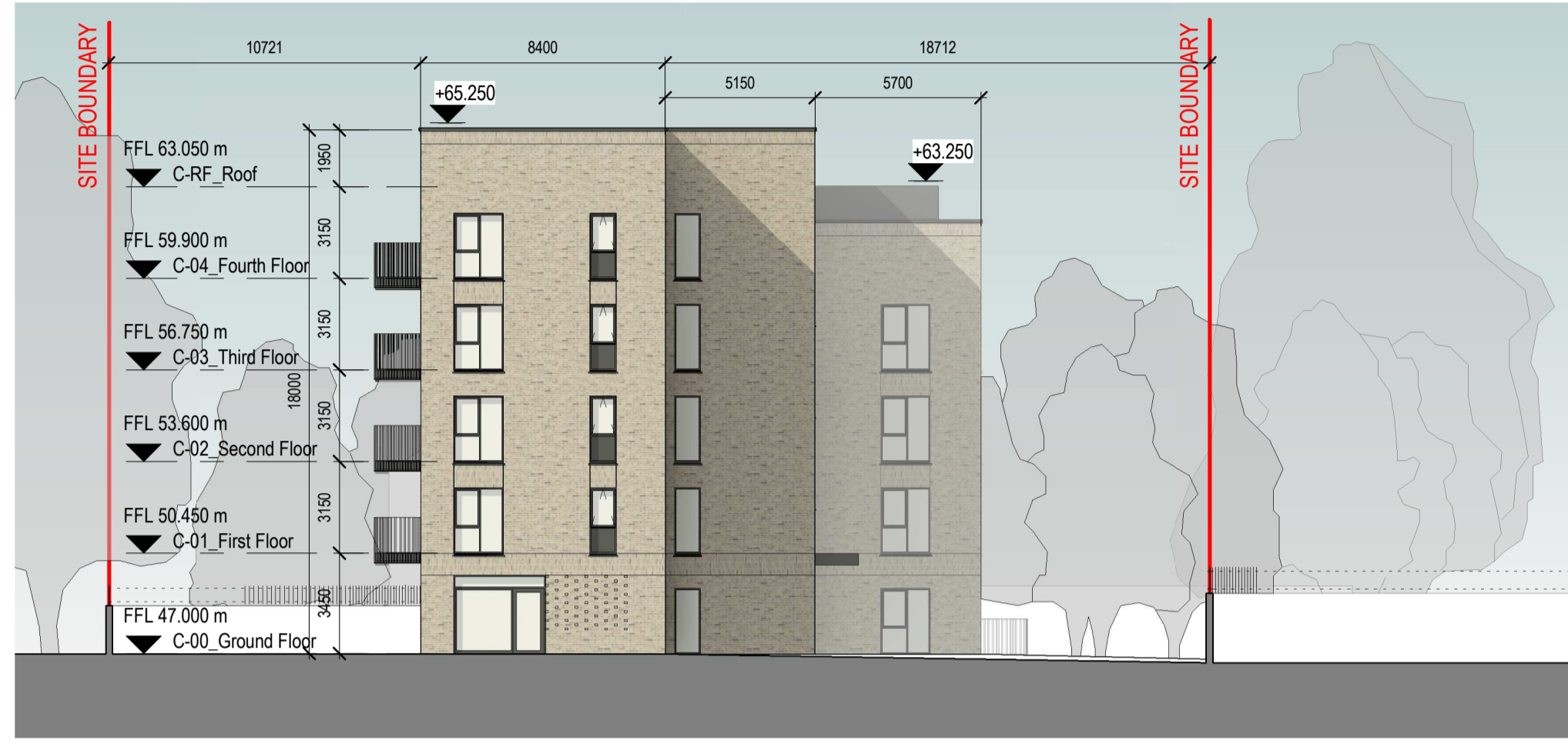
3 Block C - East Elevation with Context 1:200