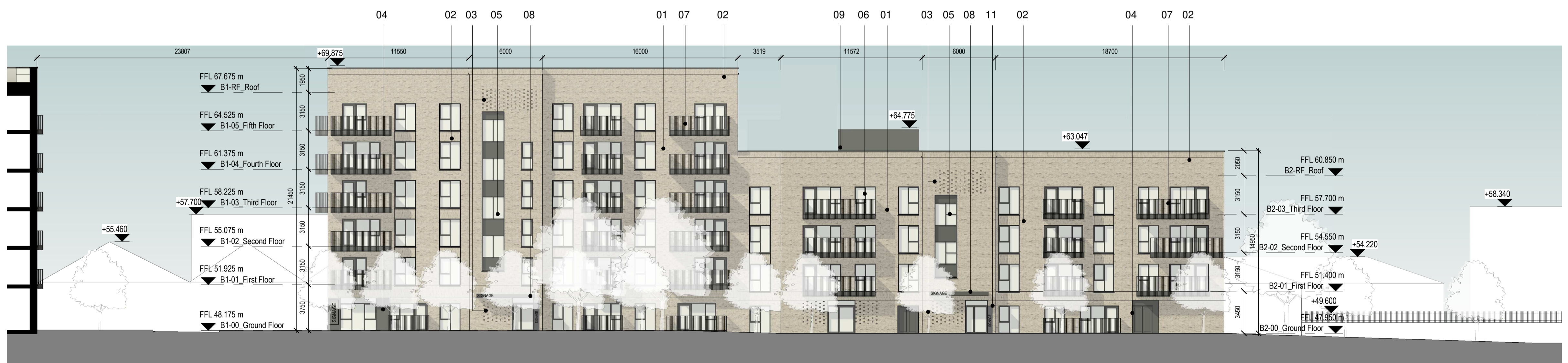
2 Block B - South Elevation with Context 1:200