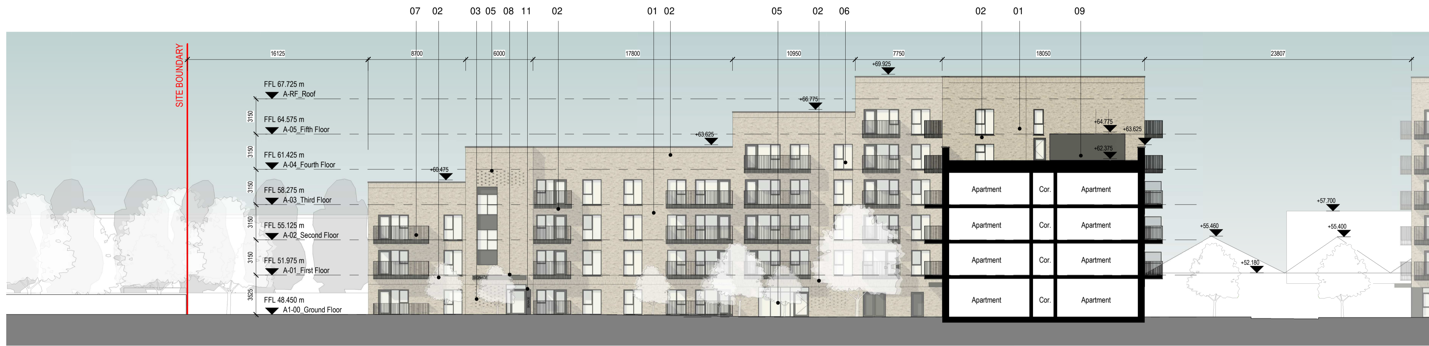
1 Block A - South Courtyard Elevation with Context 1:200