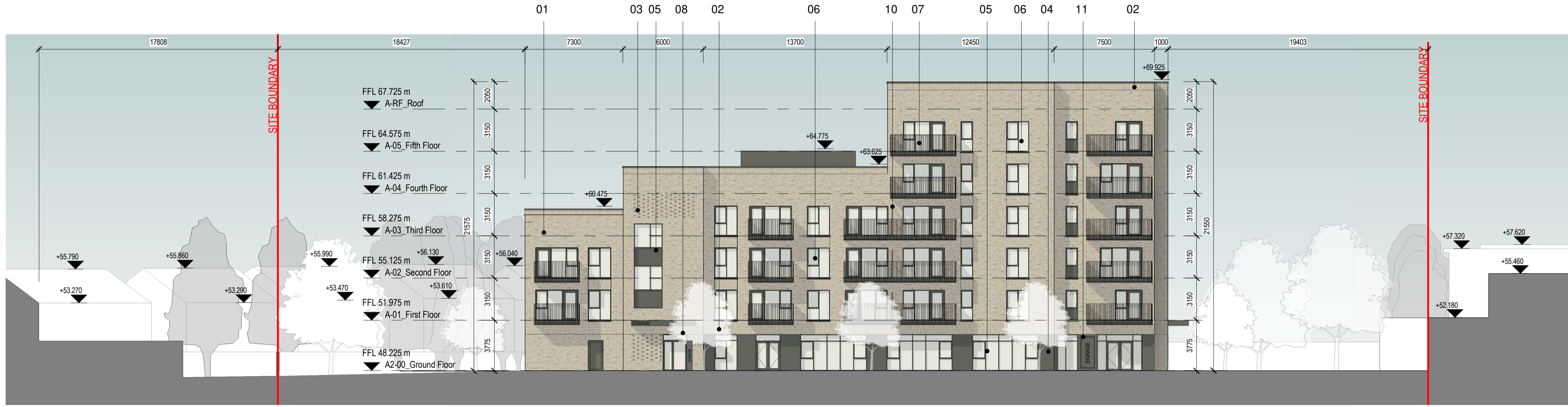
1 Block A - East Elevation with Context 1:200

Notes: Do not scale from this drawing. Use figured dimensions only. All errors and omissions to be reported to the Architect. This drawing to be read in conjunction with relevant consultant's drawings. All dimensions are in millimetres and all levels are in meters to match Datum unless otherwise noted. Contractor Design Responsibility It is noted that there are many elements within the works that require contractor design, and will be subject to certification as part of BCAR - see Preliminary Inspection Plan for clarity on certification required. © This drawing or design may not be reproduced without permission.