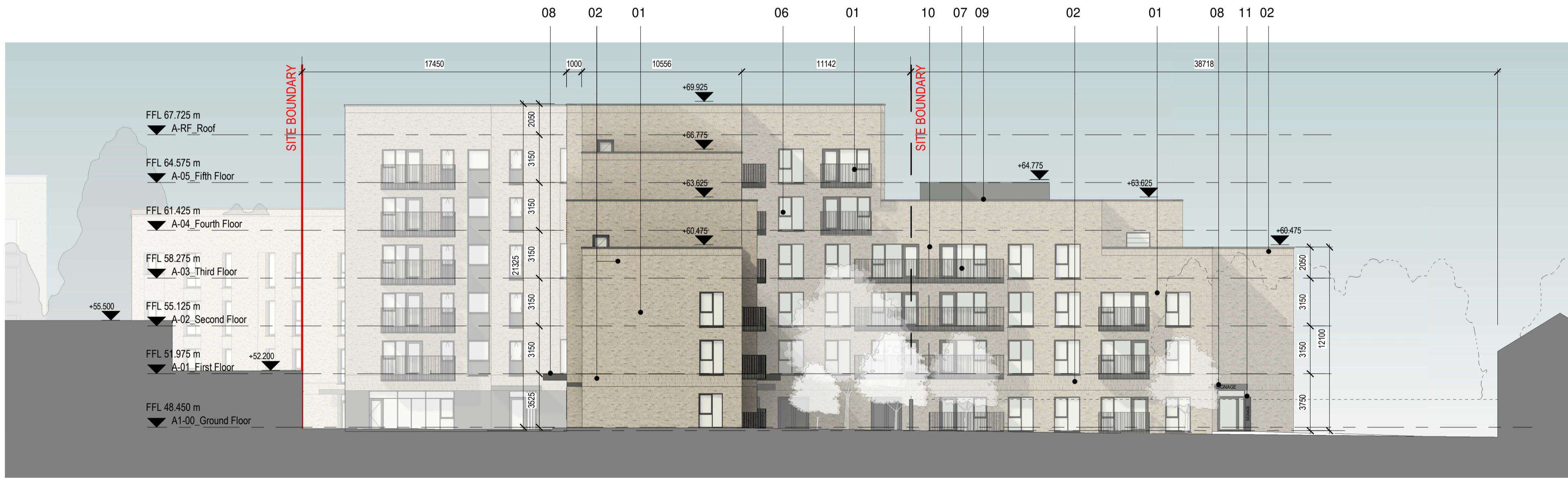
2 Block A - West Elevation with Context 1:200