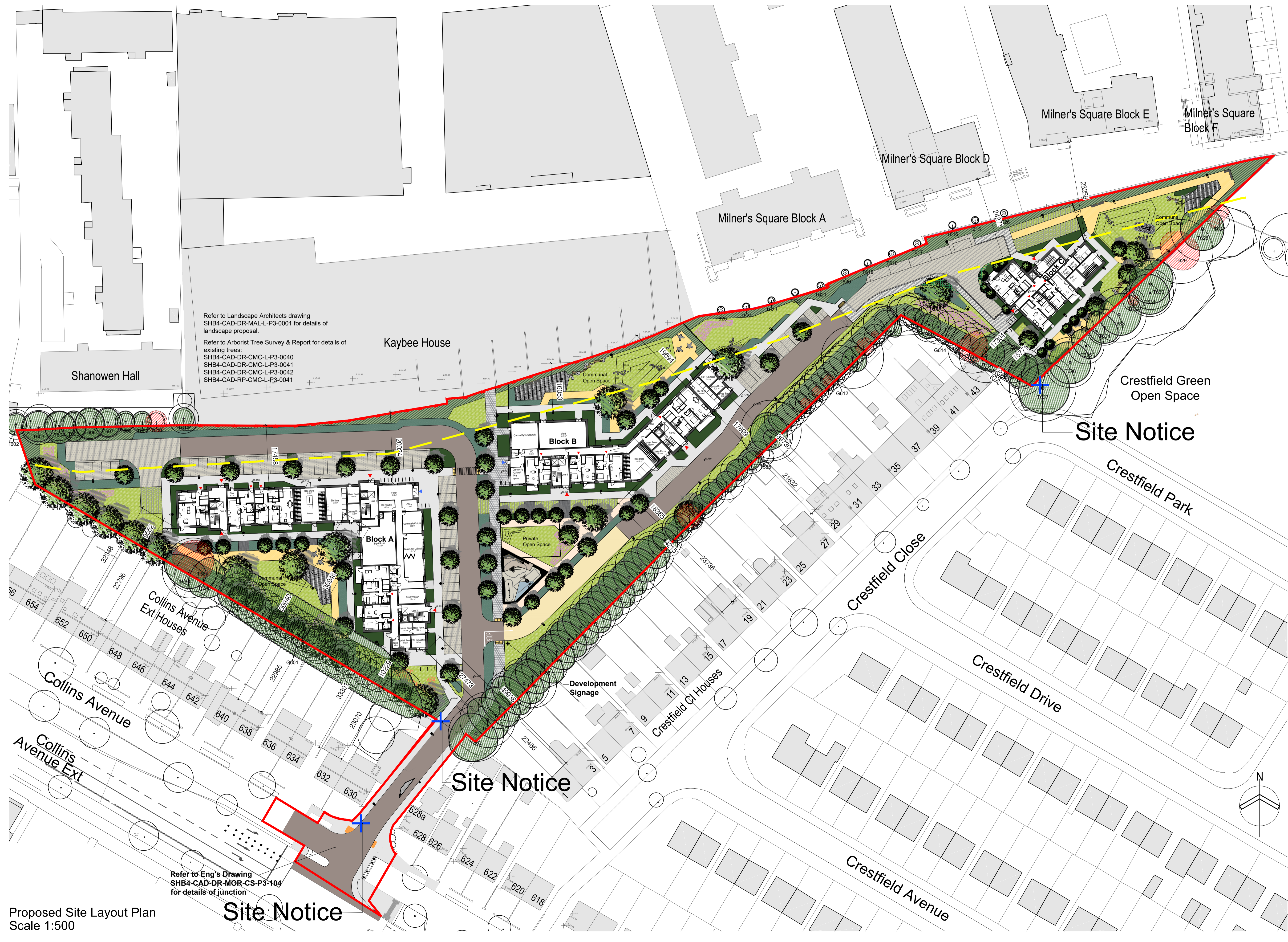
Proposed Site Layout Plan Scale 1:500