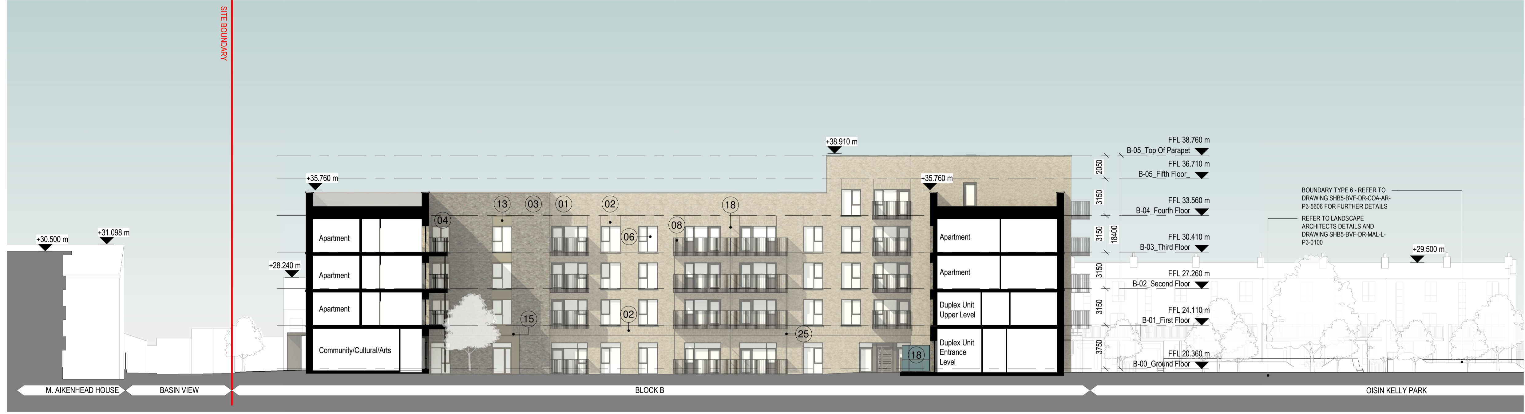
1 Section E-E 1:200