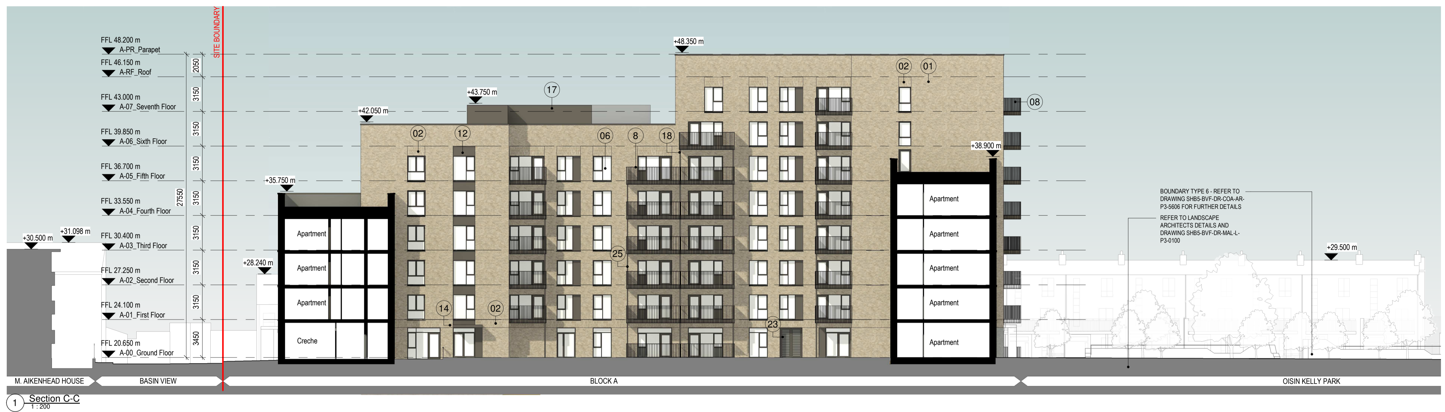
1 Section C-C 1:200