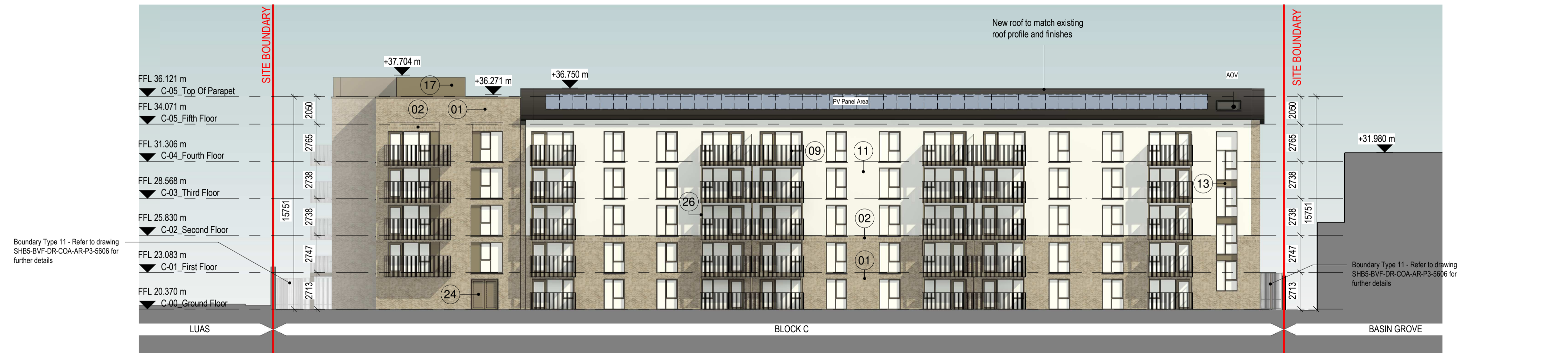
2 Block C - South Elevation with Context 1 : 200