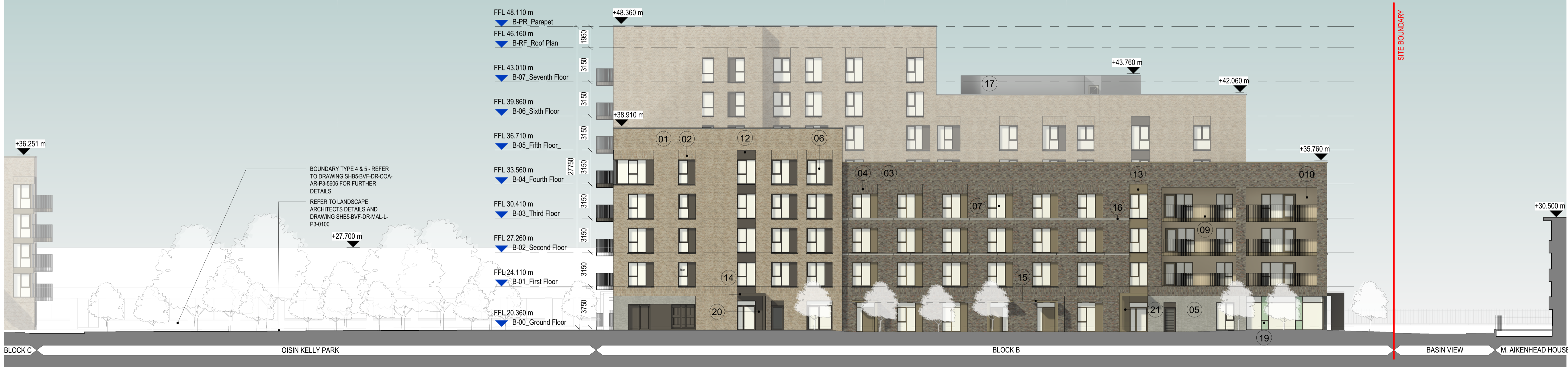
1 Block B - East Elevation with Context 1:200