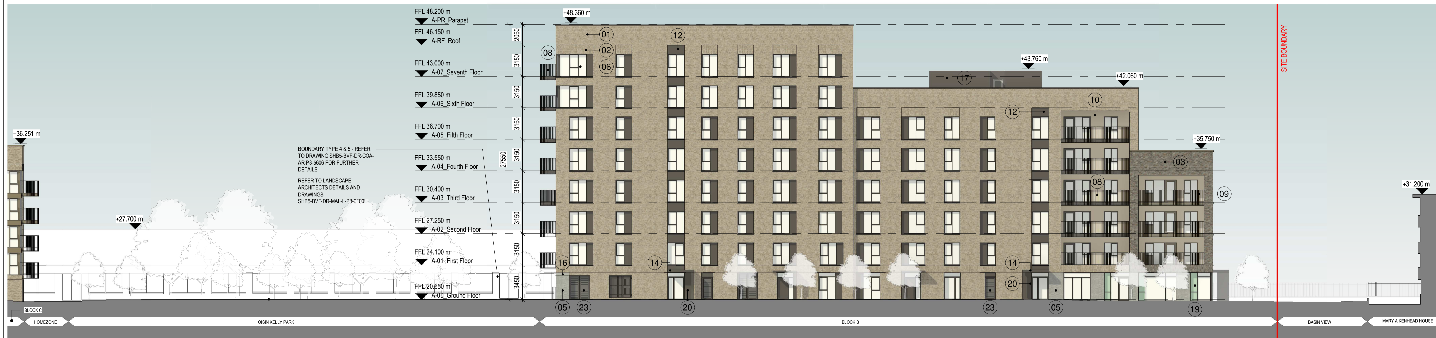
1 Block A - East Elevation with Context 1 : 200