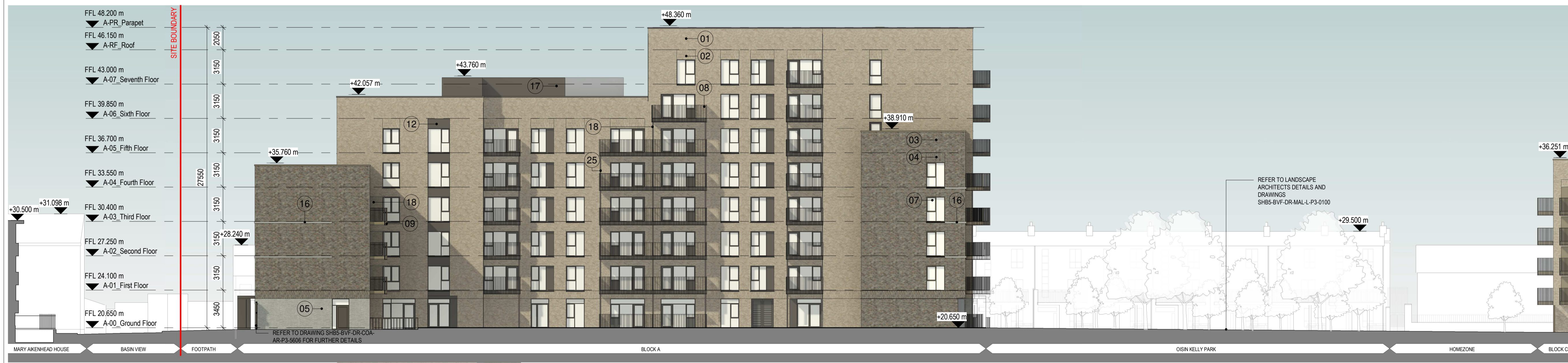
2 Block A - West Elevation with Context 1 : 200