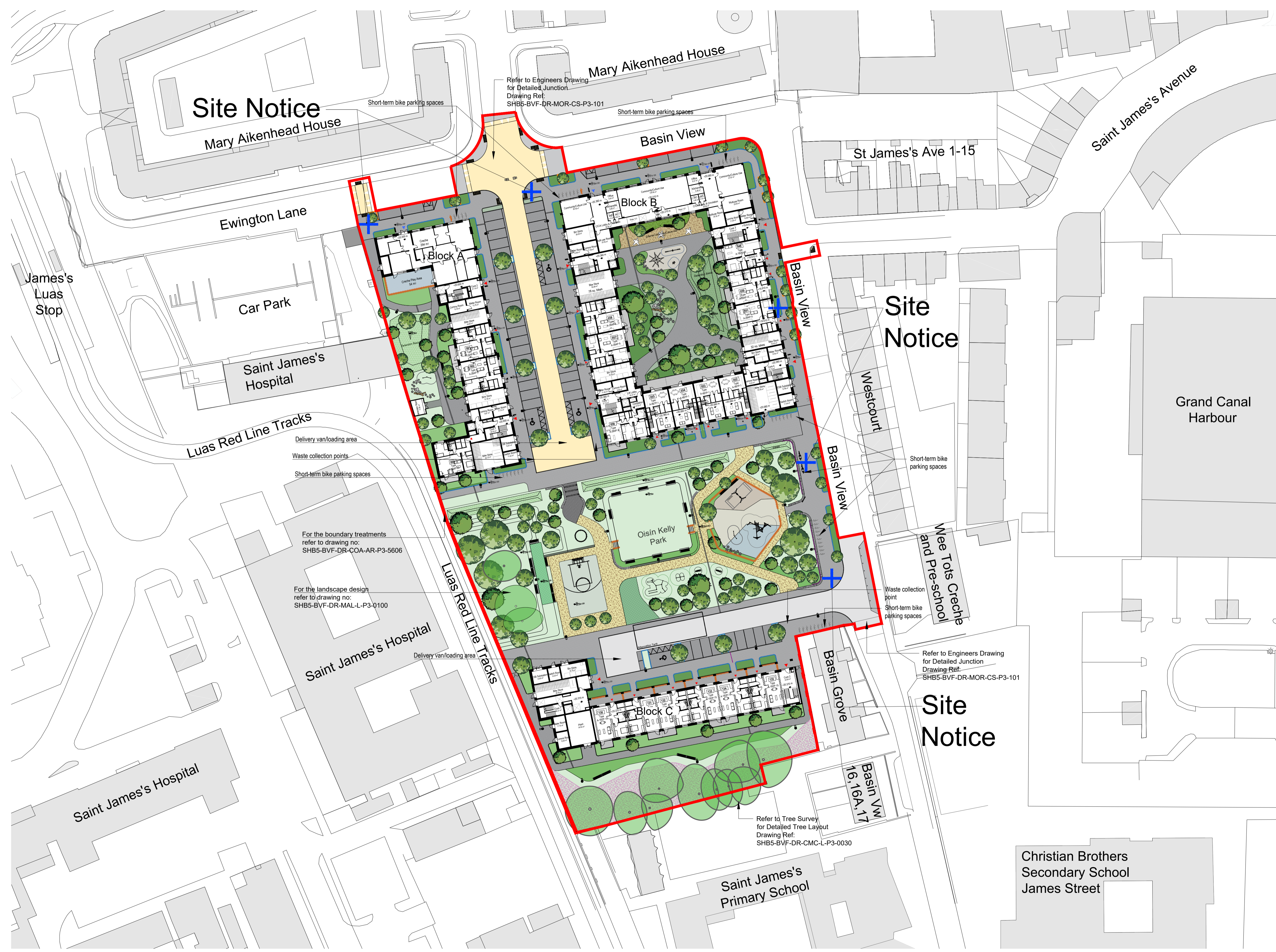
Proposed Site Layout Plan Scale 1:500