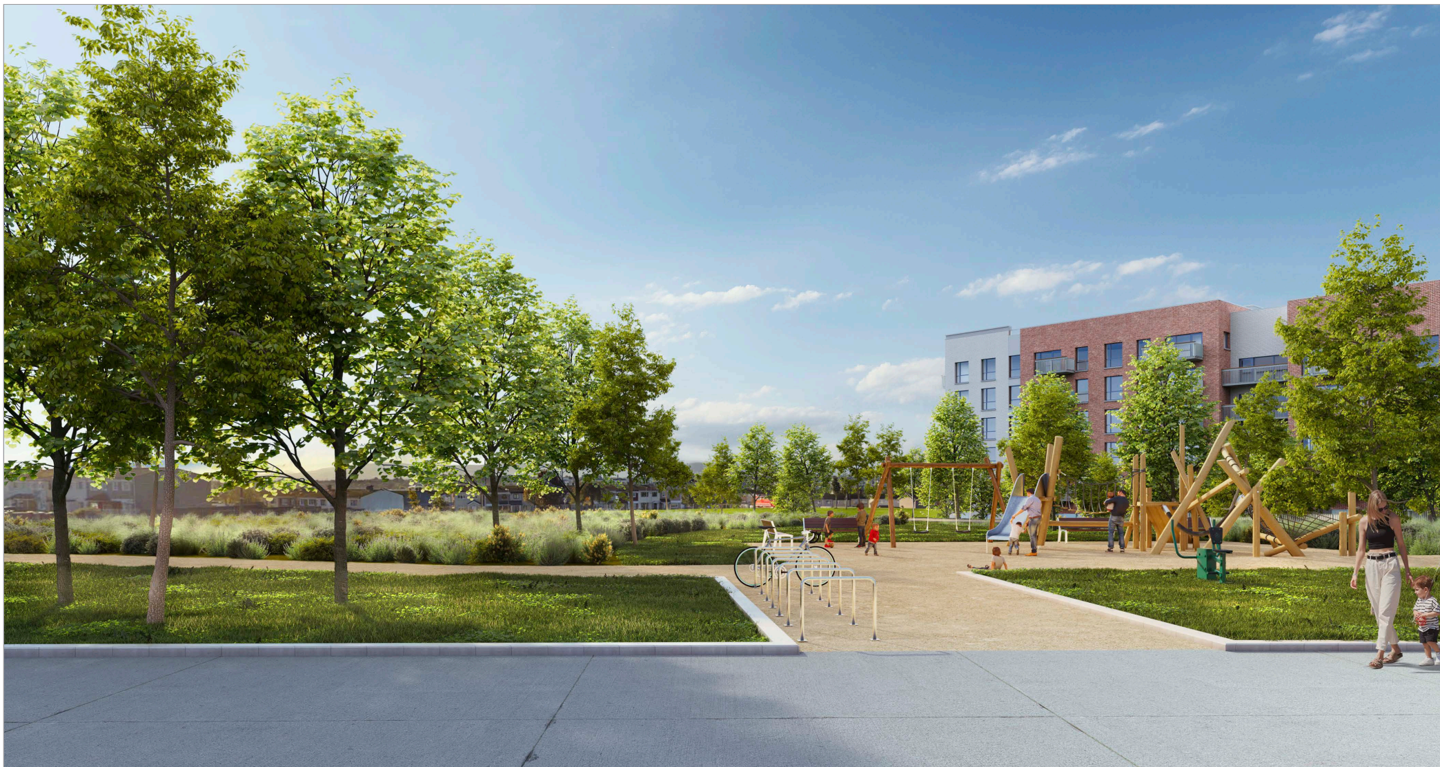
Location View 4 CGI