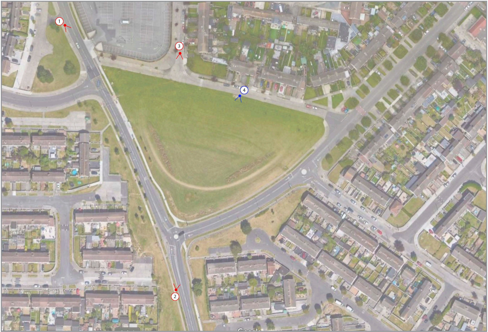
View Location Map

This map is for view location purposes only. Please refer to Architects drawings for site layout and redline boundary.