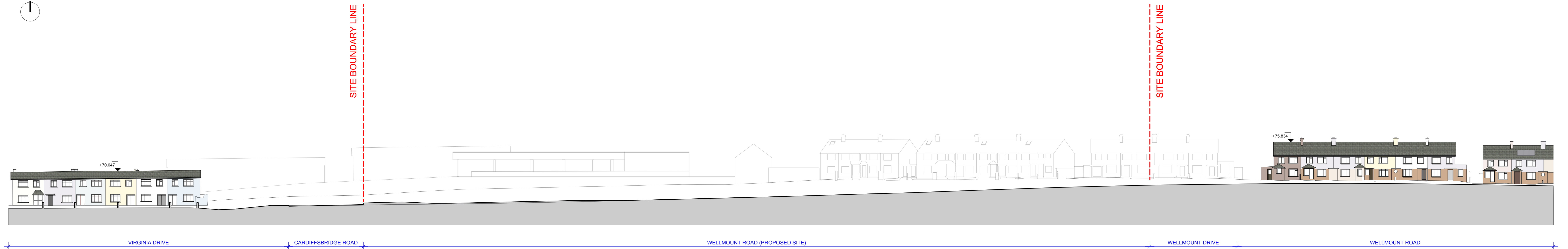
1 Contiguous Site Elevation - Existing Scale: 1:300